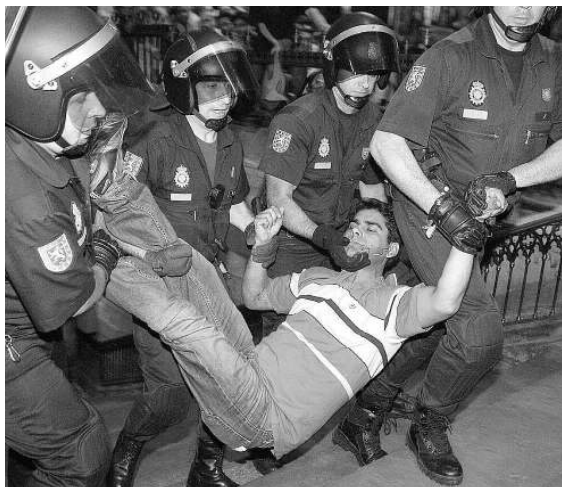
Riot police broke up a sit-in on 6 June by hundreds of illegal immigrants occupying two churches in Barcelona

In light of the growing number of Latin American immigrants, a phenomenon has been developing where the portion of émigrés' earnings sent to their home countries has become vital to Latin American economies. A study by the International Organization for Migration (IOM) on Tuesday revealed that