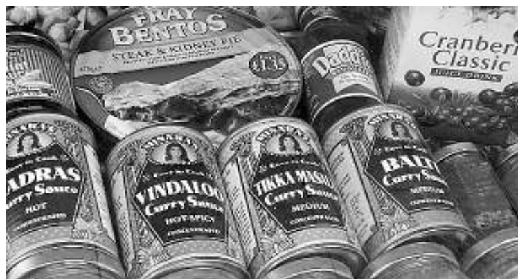
Shops are beginning to cater to the Indian and Latin American market