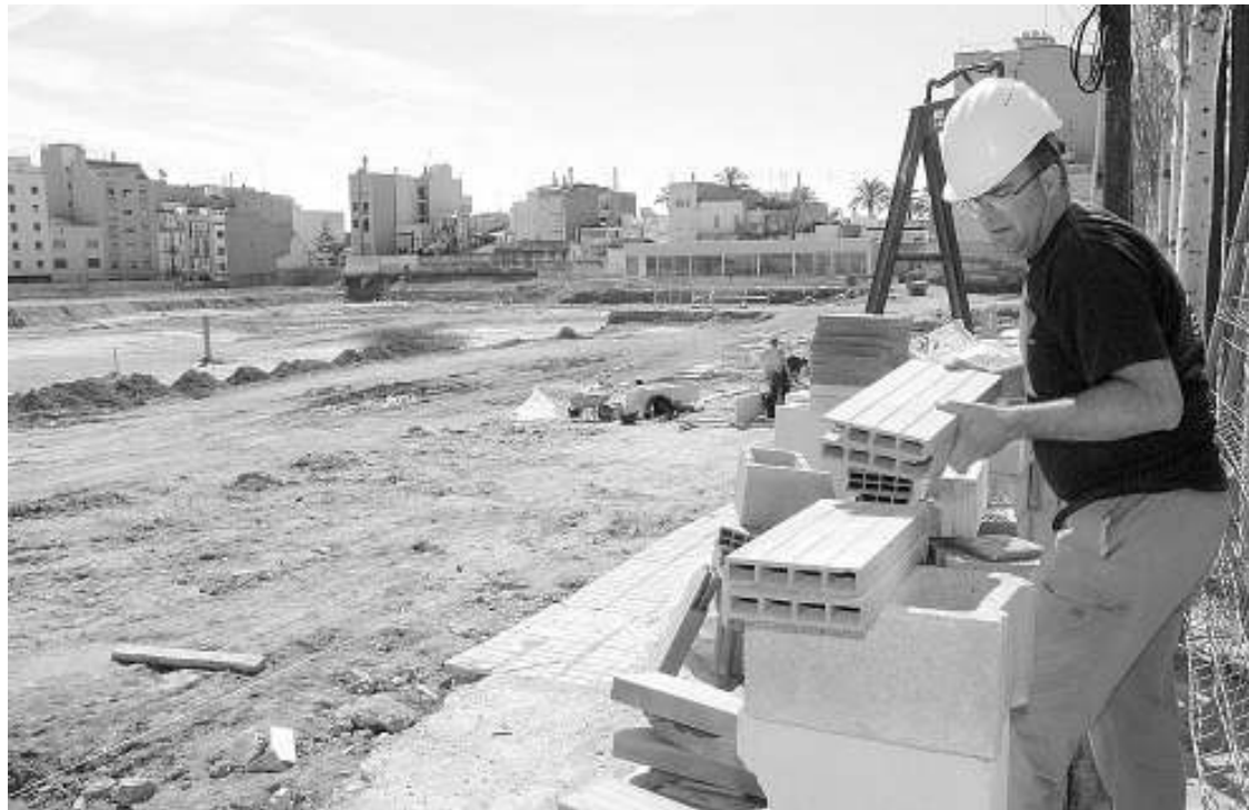
Thousands of Spanish made their millions in construction: CARLES CASTRO

In India the rich got richer last year as a result of the stock market boom and high economic growth. About 61,000 HNIs in India watched their wealth skyrocket by 22 per cent in 2003 to over 200 billion euros, the World Wealth Report declared yesterday. The growth in Indian HNIs (with more than 1 million euros) was rapid, compared to the rest of the world, which has 7.7 million millionaires. In 2002 HNIs