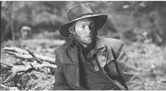
Vincent Cassel in a scene of the film.

Vincent Cassel stars in Blueberry , which has been described as a supernatural western. The film is directed by Jan Kounen, who worked with Cassel before in Dobermann , six years ago and is inspired by two cartoon books: La Mine de l’Allemand and Le Spectre aux balles d’or . The action takes place in the natural settings of a western: endless areas of desert with the breathtaking splendours of the gigantic canyons and acquires a mystical aura as it focuses on shamanism,