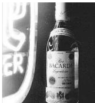
Don Facundo Bacardi Massó

The Bacardi brand became much loved in the US, to the point that the American general Leonard Wood appointed Don Facundo's eldest son mayor of Santiago de Cuba. Later on, the company also helped to attract Americans to the island. During Prohibition, Bacardi invited