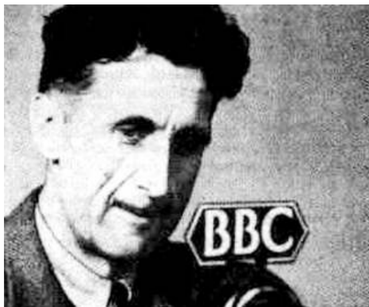
To Orwell, the defenders of Dalí's work had placed him in a privileged position in which he could enjoy moral irresponsibility