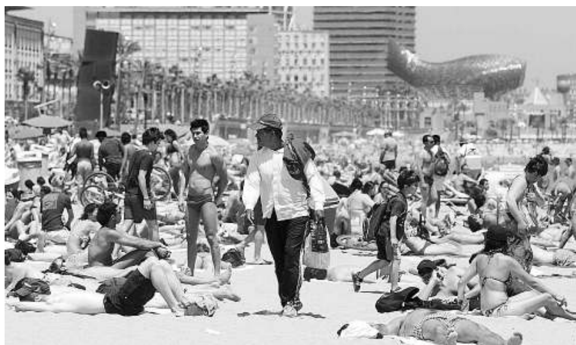
View of a beach in Barcelona where bins will be distributed to reduce waste

ior ministry noted that only 174,000 Ecuadorians had legal residence in Spain. Even if they are not legal, immigrants are encouraged to register with the local authorities to gain access to services like free health care.