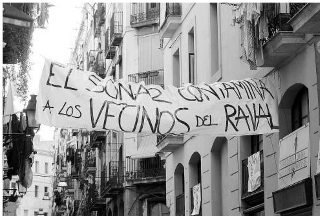
Residents of el Raval in Barcelona protest on the eve of the beginning of the 11th Sónar festival.

The Greek national team are eyeing a place in the last eight after prising a point from Group A favourites Spain. Angelos Charisteas crashed home the equaliser for Greece after the Spanish defence failed to deal with a long ball. Fernando Morientes gave Spain a first-half lead, collecting Raul's backheel to sidestep a defender and finish. Final score: Greece 1, Spain 1.