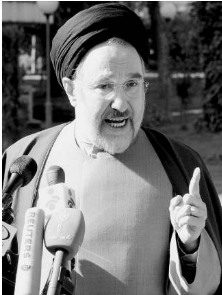
President Mohammad Khatami says Iran's nuclear programme is legitimate

He characterised the draft as being "counterproductive for the continuance of co-operation" and suggested that Iran may consider halting some of its business dealings