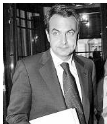
Spanish prime minister Zapatero

"We are facing a difficult problem, of great economic proportion," the prime minister said. Zapatero reminded Duran Lleida that the toll debate was never resolved when his own party Convergenci i