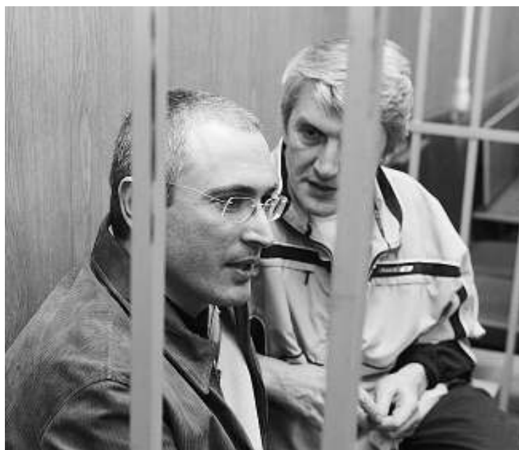
Mikhail Khodorkovsky faces up to 10 years in prison.

Another of Khodorkovsky's lawyers accused the government of conducting the trial in a less than transparent fashion. According to a report by AFP, a news agency, only ten journalists were allowed into the