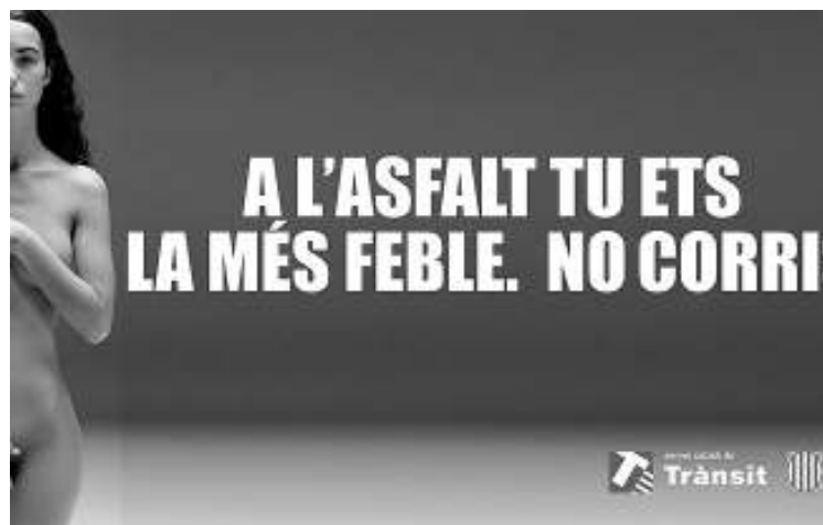
The advertisement that forms part of the new road safety campaign

Filmed using a hand-held camera, the television advert simply shows a girl, a boy and a middle-aged man against a blue background. Meanwhile, a voice-off says: "You don't have any lateral protection barriers or an unbreakable structure". The clip does not include any violent images or bloody corpses, as the traffic authorities decided to take a different approach to