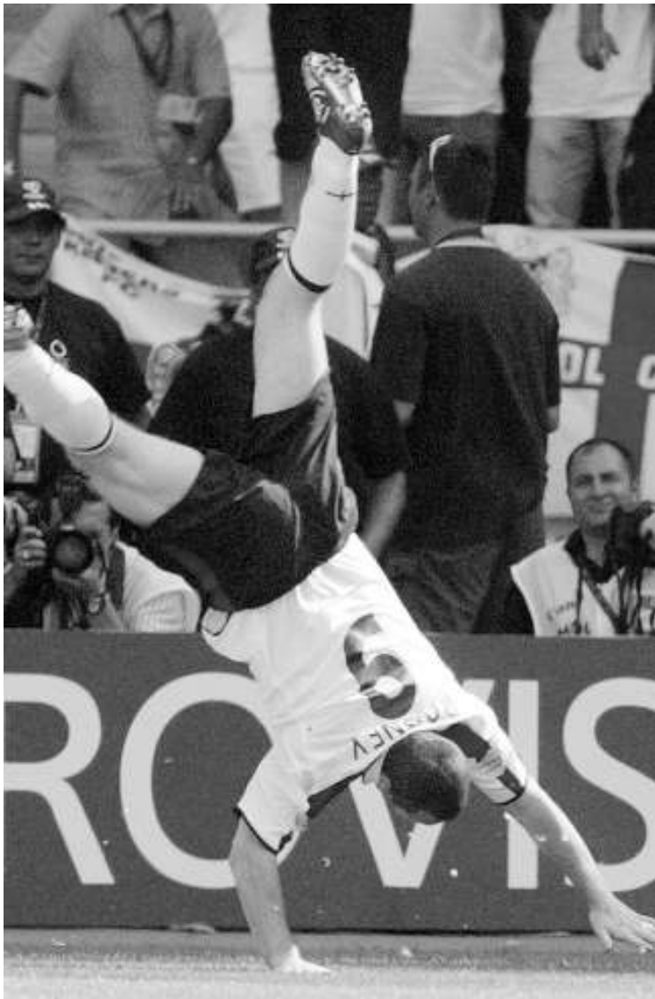
Wayne Rooney, the 18-year-old who has captured everyone's attention at Euro 2004

One revealing anecdote I heard the other day tells of when the twelve-year-old Rooney (who plays for Everton, who he has always supported) was given a trial for Liverpool F.C., the city's other main club. Though most English twelve-year-olds would kill their granny to get such a chance, Rooney - who was dragged along unwillingly by a talent scout - made it clear what he felt