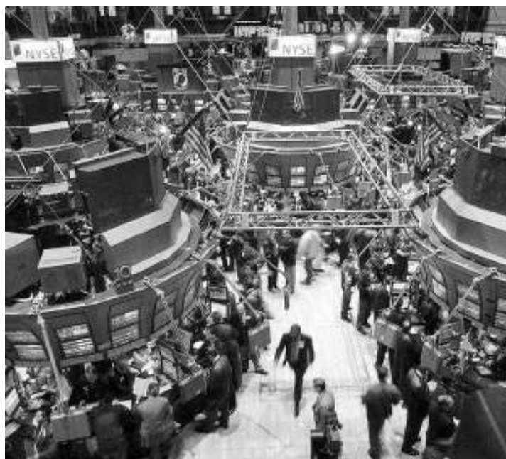
Image of the New York stock exchange

On the other hand, the American economy is experiencing a strong recovery as shown by the publication of some leading indicators. In Deutsche Bank, we expect a growth in the American GDP of about 5% this year, and 4% in 2005. On the other hand, investors fear that a rise in economic activity combined with high oil prices could lead Federal Reserve chief Alan Greenspan to raise interest rates more than originally expected. We find ourselves in a recovery situation that will bring increased profits for companies, but