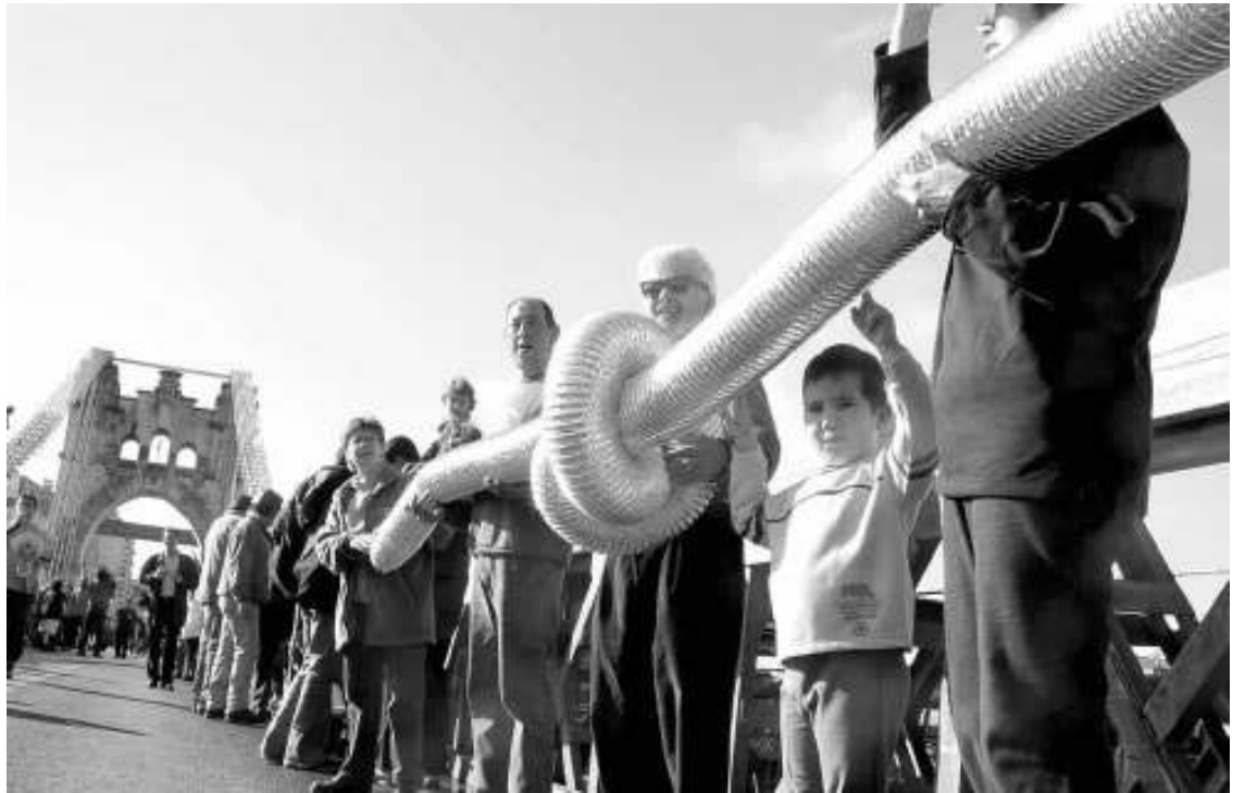
Ex-President Aznar lays the foundation stone for the PHN project in February 2004, in spite of vociferous protests. Right, the famous "knot" protest symbol