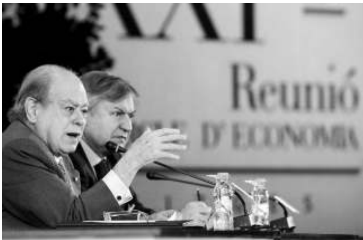
Above: leader of Spanish opposition, Rajoy. Below: Ex-president of Generalitat, Pujol