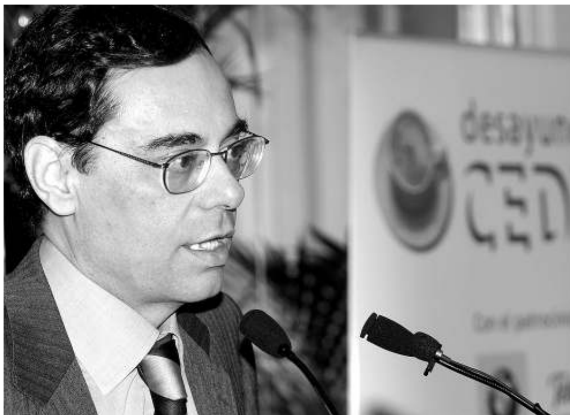
Bank of Spain governor Jaime Caruana

In the report, the Bank of Spain asks that price increases of the last few months not translate to increases in profits and salaries, and in this sense, it asks for a reform of the system of collective bargaining to establish a better ratio between increased labour costs and the specific