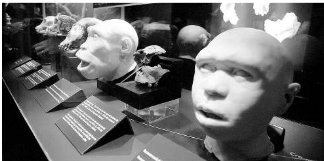
The exhibition of the oldest human fossil remains in Europe, currently on show at Tarragona\Abraham Sebastià

The exhibition Atapuerca i l'evolució humana (Atapuerca and human evolution) which has just opened in Tarragona contains the oldest human fossils discovered in Europe, and includes a reconstruction of the famous 800,000-year-old skull of a boy from the species Homo antecessor , considered to be the very first European. The exhibition is on at Tinglado 1, Moll de Costa in Tarragona.