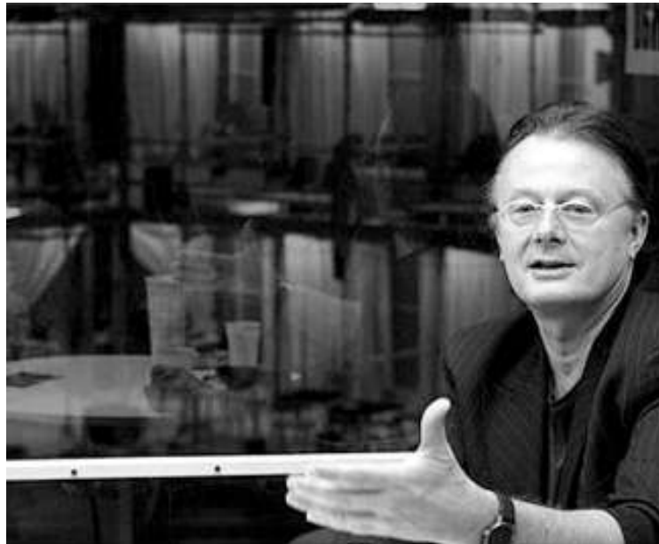
Frank Castorf is director of the German theatre company Berlin Volksbühne

"Forever Young", performed at the Festival of Vienna in 2003, deals with the themes of a loss of youth and the erosion of democracy. Williams' play, its inspiration, was performed in 1959, is a critique of a narcissistic American society. It portrays the life of the character Tom Finlay, who succeeds in conducting his criminal dealings and climbing to a top position in the state with his Christian rhetoric and his well calculated involvement in a private fas-