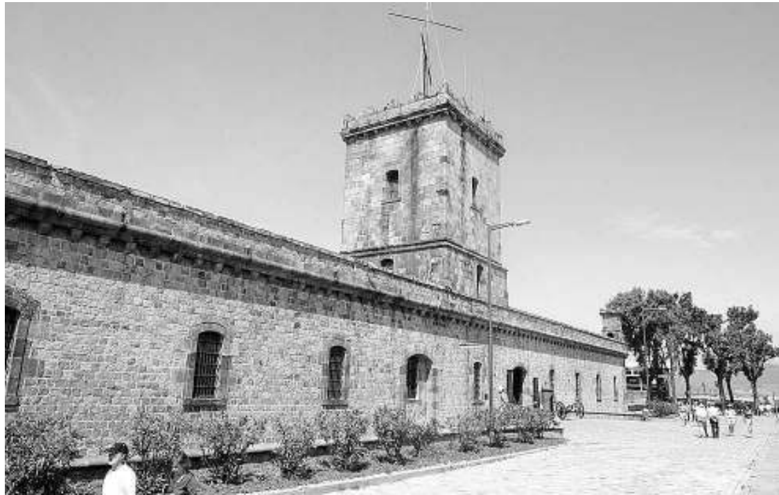
The castle of Montjuïc where many battles were fought will be turned into a peace museum

After Franco turned the castle into a military museum, its presence is like salt in the wounds of the collective Catalan memory, an emblem of humiliation. Now, under Catalan ownership, it remains to be seen how this tomb of local grievance could soon be turned into a memorial - a European peace museum.