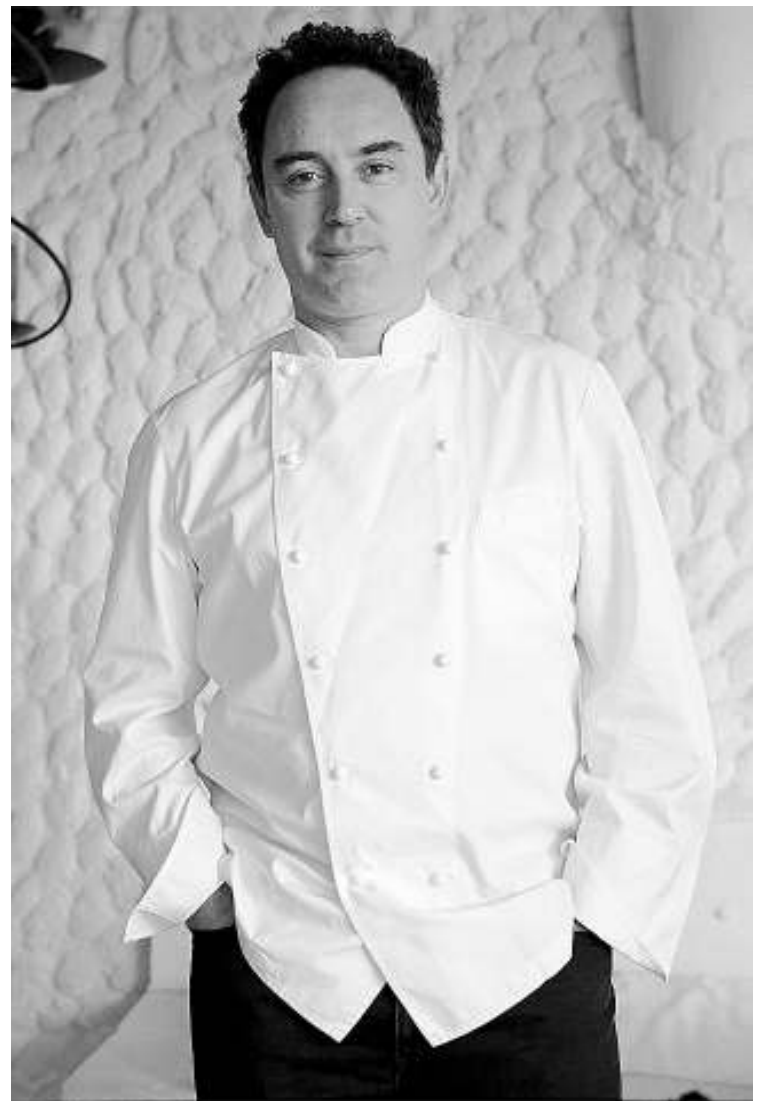
Adrià claims it was only by chance that he became a chef.

“In the laboratory we talk a lot, we look for the spark. I want to create a dish that will change the world, the question is how?”