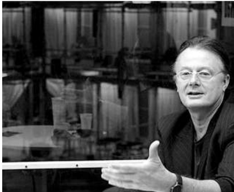
Frank Castorf is director of the German theatre company Berlin Volksbühne

"Forever Young", performed at the Festival of Vienna in 2003, deals with the themes of a loss of youth and the erosion of democracy. Williams' play, its inspiration, was performed in 1959, is a critique of a narcissistic American society. It portrays the life of the character Tom Finlay, who succeeds in conducting his criminal dealings and climbing to a top position in the state with his Christian rhetoric and his well-calculated involvement in a private fas-