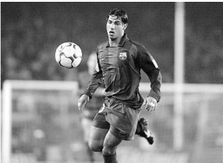
Quaresma has had a stormy relationship with Rijkaard, the Barça coach