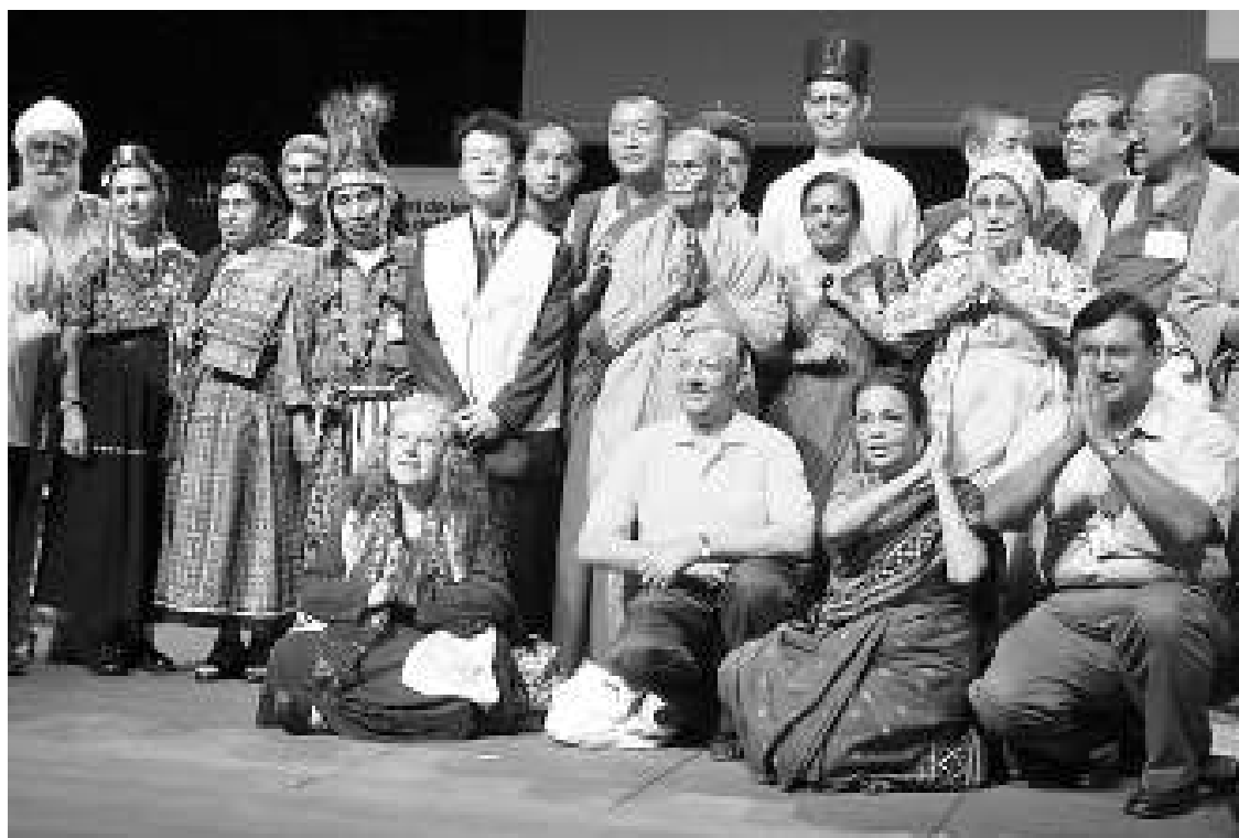
Religious leaders gathered yesterday for the opening ceremony of the Parliament of the World's Religions at the Forum