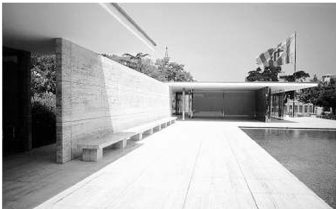
The Mies van der Rohe pavilion in Montjuïc is highlighted in the guide and is a replica of the 1929 original / CARLOS IGLESIAS