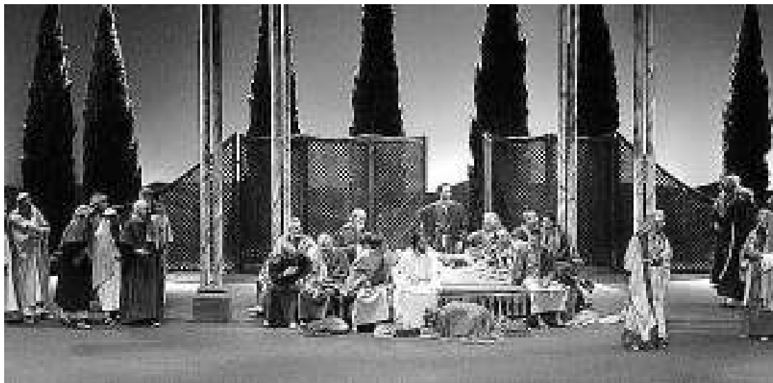
Mary Magdalene kneels at the feet of Jesus, shown in a tableau at the feast at Simon's house

The 7 July performance will be an abridged version lasting for two hours and featuring the main scenes from the Olesa Passion. The theatre company decided to give a free performance so that more people will have the chance to see one of the finest mystery plays in all of Catalonia.