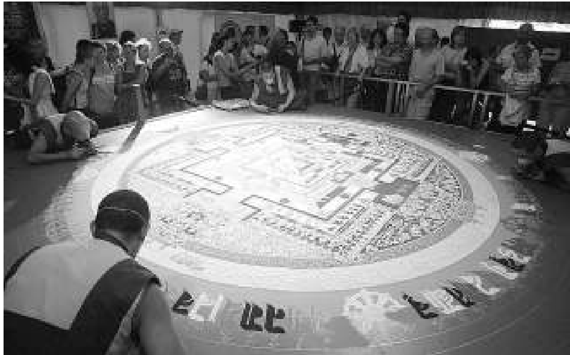
Six Tibetan monks have designed the work using millions of pieces of sand and measures four metres in diameter

The Catalan police the Mossos d'Esquadra have arrested three men who have been accused of robbing seven romanesque capitals from the hermitage of Sant Llorenç de les Arenes de Foixà. The three men, who are all from the town of Flaçà, stole the seven capitals (each worth a million euros) on 3 June from the old church in the Baix Empordà region. Eight days later, on 11 June, the Mossos found two of the pieces on a farm in Flaçà, though the whereabouts of the other five is still unknown.