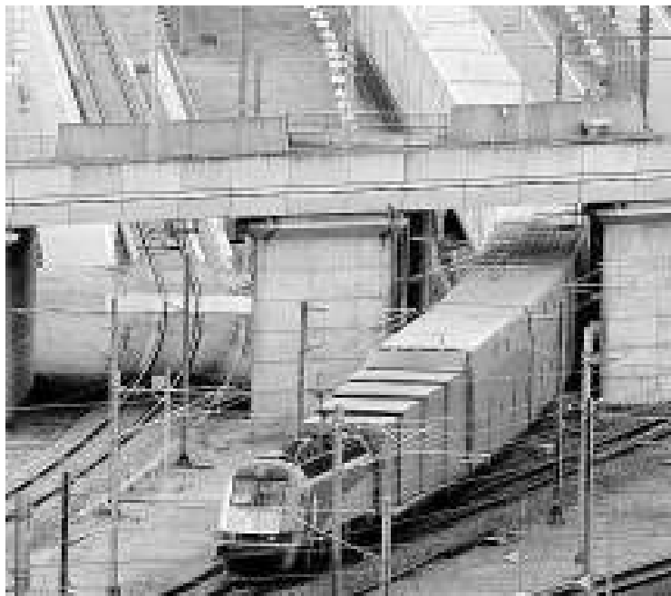
The Eurotunnel company is considering modifying fees for vehicle transport

The new managers did not provide specific information about how they planned to reduce the company's debt, but promised to "take positive steps" towards the preparation of a plan for refinancing. "With the support of the best legal and financial experts (Eurotunnel) have begun the process of getting in con-