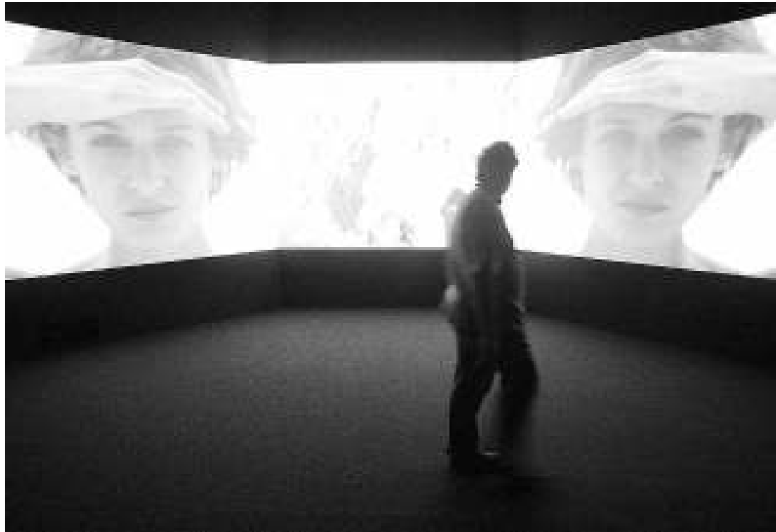
One of the many stunning images from Doug Aitken's video and sound exhibition currently on show at Caixaforum

Using moving images as a sign of life, Doug Aitken plays with time in a series of daring video creations in his first exhibition in Spain. We are safe as long as everything is moving is not only the title of Aitken's exhibition which opened yesterday at the CaixaForum, the name also expresses the reasons why the better-known contemporary American artists like to use constantly-moving images in their work, claiming that life exists in movement. This exhibition, Aitken's first in Spain, includes three architectural exhibits with video and sound channels, a series of photographs and a sound exhibit specially made for the Mies van der Rohe Pavilion. Fragmentation, ellipsis and acceleration or deceleration of normal rhythms are some of the most obvious devices that Doug Aitken uses in these huge works, resulting in a spectacular exhibition which cannot fail to surprise spectators. Born in Redondo Beach, California in 1968, Aitken has collected a series of videos recorded all around the world in which faces, rhythms, landscapes, silences, devices and gestures all follow one another at a dizzying speed to tell stories that demand that the spectator