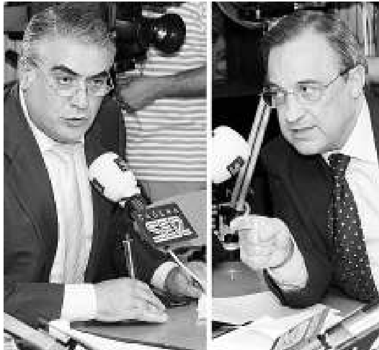
Lorenzo Sanz and Florentino Pérez - the two main candidates for Madrid's presidency

With the elections set for this Sunday, the two main candidates have been setting out their ideas, which of course always means who they are planning to sign. On Tuesday Sanz appeared before the press