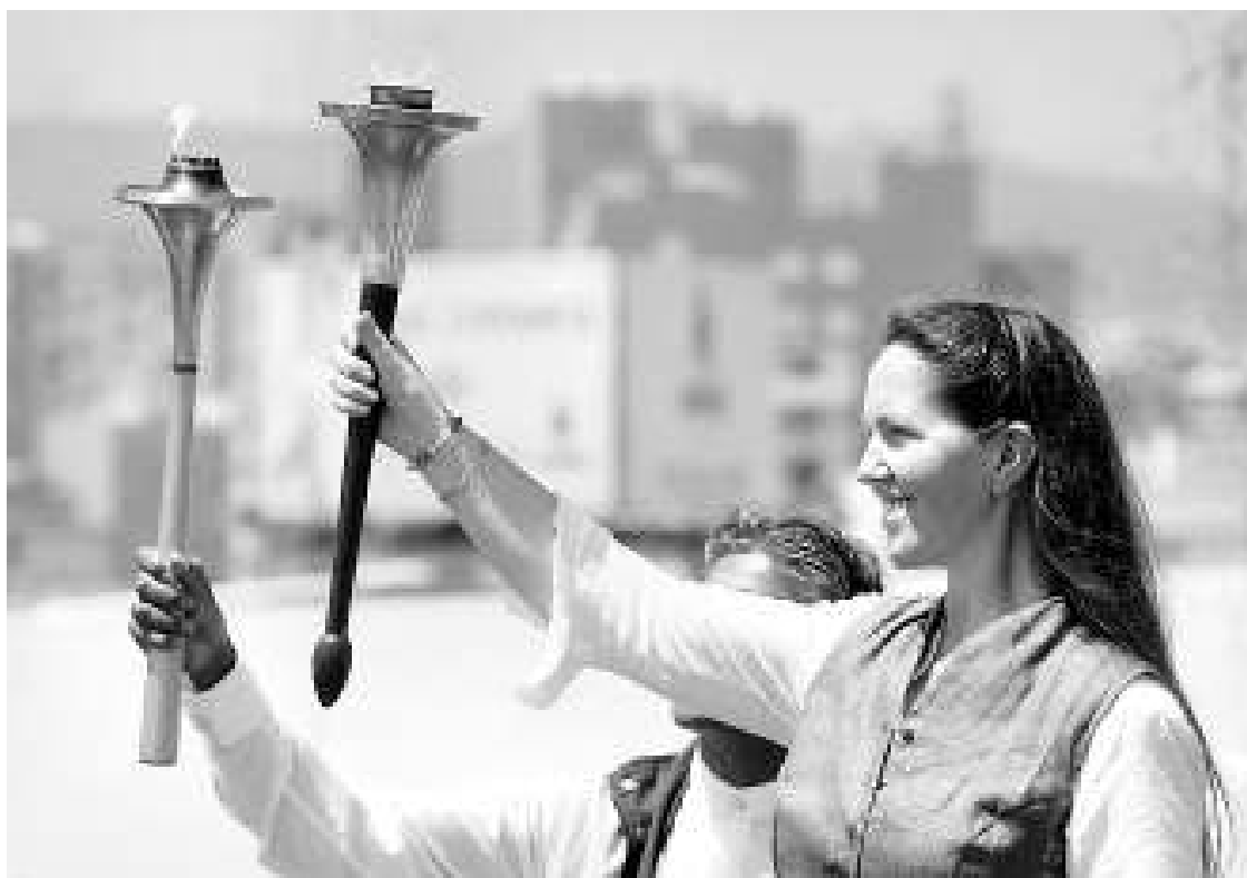
Religious leaders finished their meeting at Montserrat yesterday. Meanwhile in Barcelona, the flame of peace was lit at the opening ceremony for the Parliament of the World's Religions