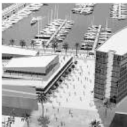
Computer projection of hotel scheme for Badalona