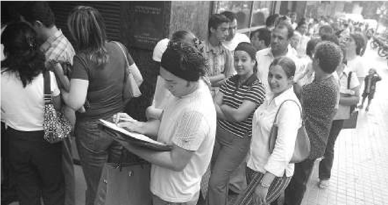
A queue in front of an employment bureau (INEM) office in Barcelona. An OCED report contained recommendations for reducing unemployment in Spain