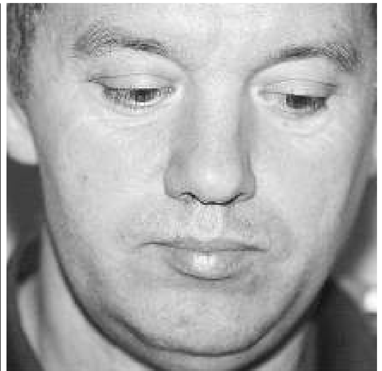
Jacques was forced to resign as French coach after his team's failure at Euro 2004

should know that it is not easy to outface Pérez, and sure enough, the mild-mannered president said yesterday if he is re-elected, Eto'o will be playing for Madrid next season. Pérez also reiterated his plan to sign Carvalho and Xabi Alonso, though he had that same smile on his face meaning he might have another surprise up his sleeve. Any bets on Ronaldinho wearing white next year?