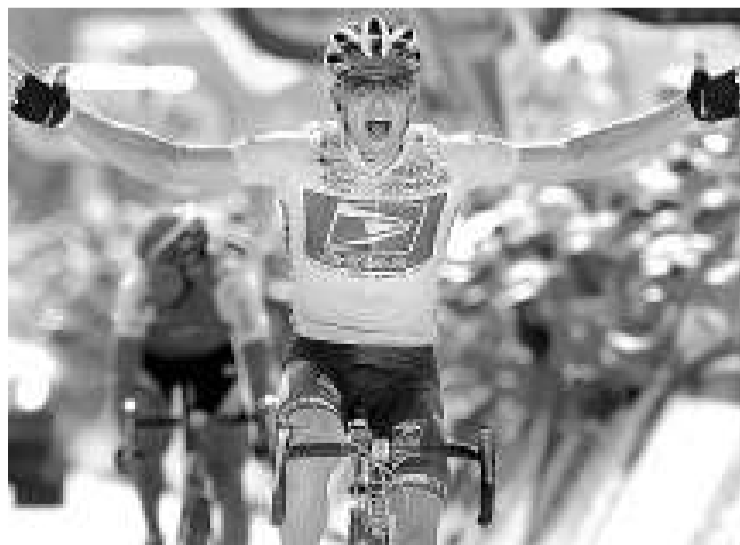
In his bid for a record sixth Tour win, Lance Armstrong is proving to be unstoppable

mountain stages of this year's Tour and only served to emphasize his dominance over his closest rivals. He finished second in the other mountain stage to Italy's Ivan Basso, who is second overall. Armstrong was part of a group of 18 riders who broke away from the peloton to ride down Christophe Moreau, Richard Virenque and Gilberto Simoni — who at one stage led by more than five minutes — in the category one climb up the Col de la Croix Fry in the final 12.5 miles.