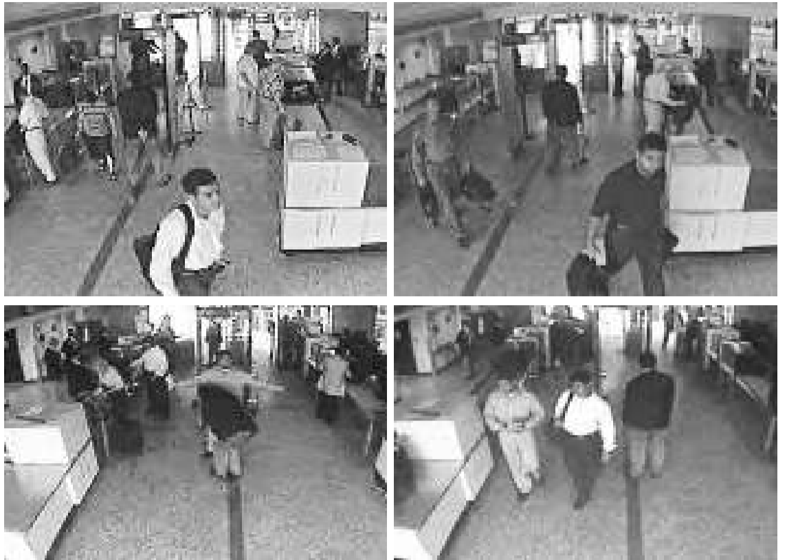
Video images from Dulles Airport show suspected terrorists being searched by security personnel and then allowed to pass through the security area before boarding the plane that soon afterwards crashed into the Pentagon

The video shows Majid Muqid, Khalid Almihdhar, Hani Hanjur and brothers Nawaf and Salam Al-hazmi arriving at a security station. Two of the men set off metal detectors but were eventually cleared for boarding. A CNN report said that pocket knives could have set off the alarms, but would not have prevented them from boarding as such objects were not banned on flights prior to the 9/11 attacks.