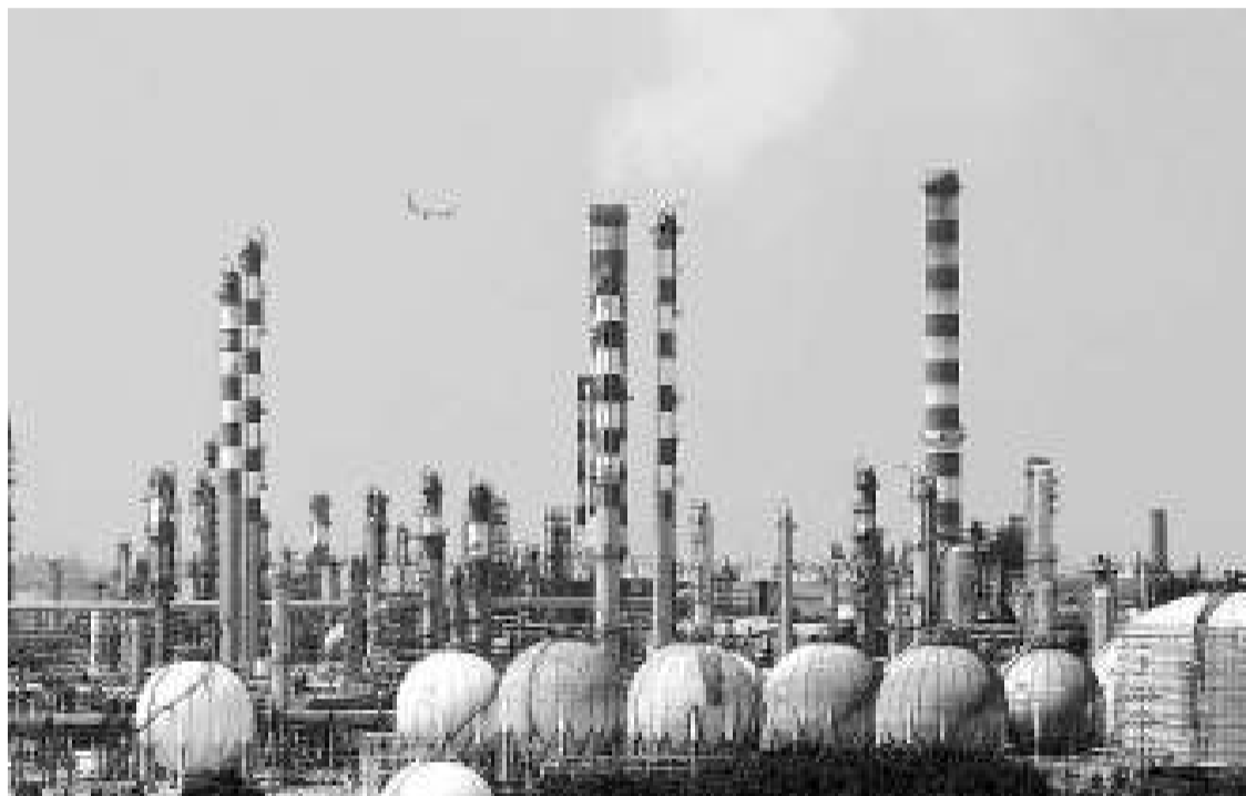
The petrochemical complex in Tarragona is by far the area's largest source of industrial revenue

Even though using water from the treatment centres will provide more than 3.2 square cubic metres of water per year, Bort says that it will turn out to be more costly than the water they are currently using. Construction costs of 1.5 million euros will have a lot to do with the high price, he said, adding that it is no small task to build the pipelines