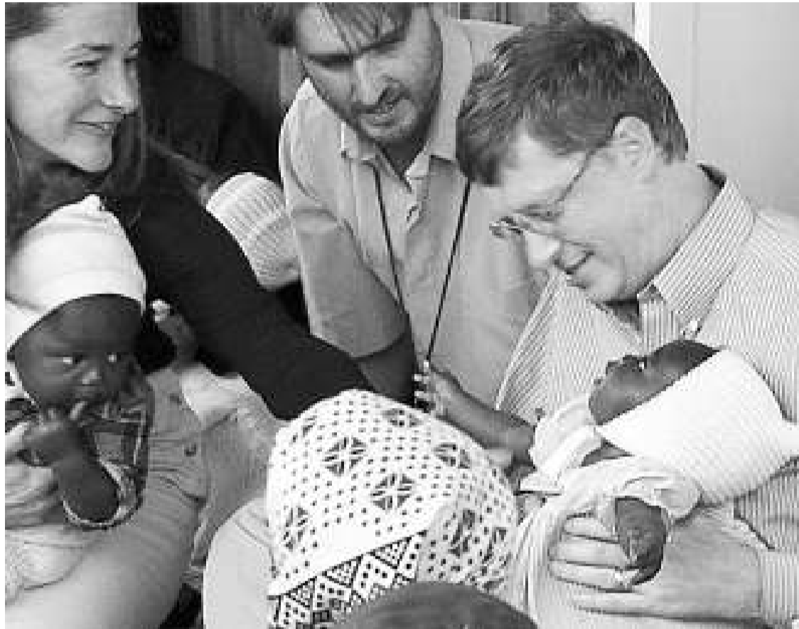
Bill and Melinda Gates during a visit to Africa to oversee a research programme about malaria control