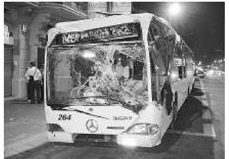
A late night bus ride ended in hospital after a stolen car collided with a bus

numerous red lights as well as the paystations in the tunnels. Police tried to maintain some distance behind it, in the hope that the driver