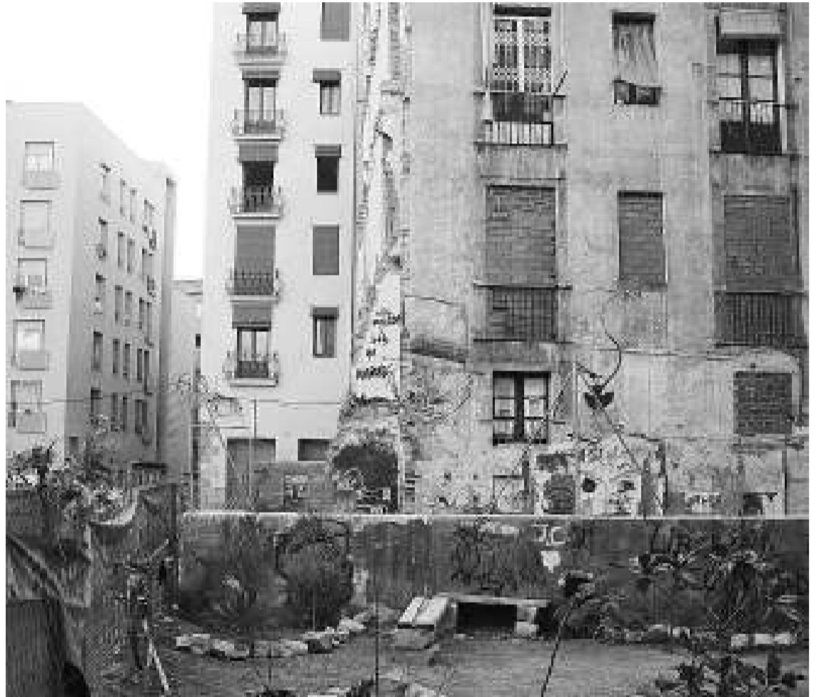
A massive programme of renovations will see demolitions and works in every corner of the city

At the same meeting, there were discussions about the problem of excessive noise in parts of the city.