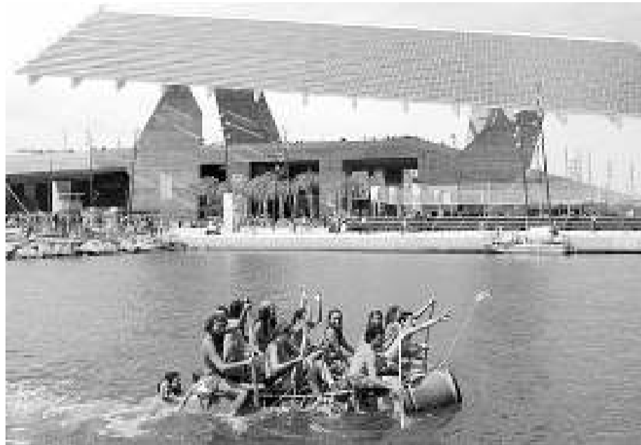
Improvising a raft to invade the Forum site / TONIALBIR / EFE

Even though the inauguration was so many weeks ago, it's still difficult to evaluate the contents of the event. One thing that is clear is that the organisers have long since lost the battle for public opinion. Nor is it easy to find intellectuals with anything positive to say. The comments to be heard at the end of the queues at the ticket offices - or rather toll booths, where you pay for the right to access the site - speak more of the extortionate prices than variety of cultures. Optimistic forecasts requiring an effort of imagination are not achieving their objectives. Even the format, trying to be original