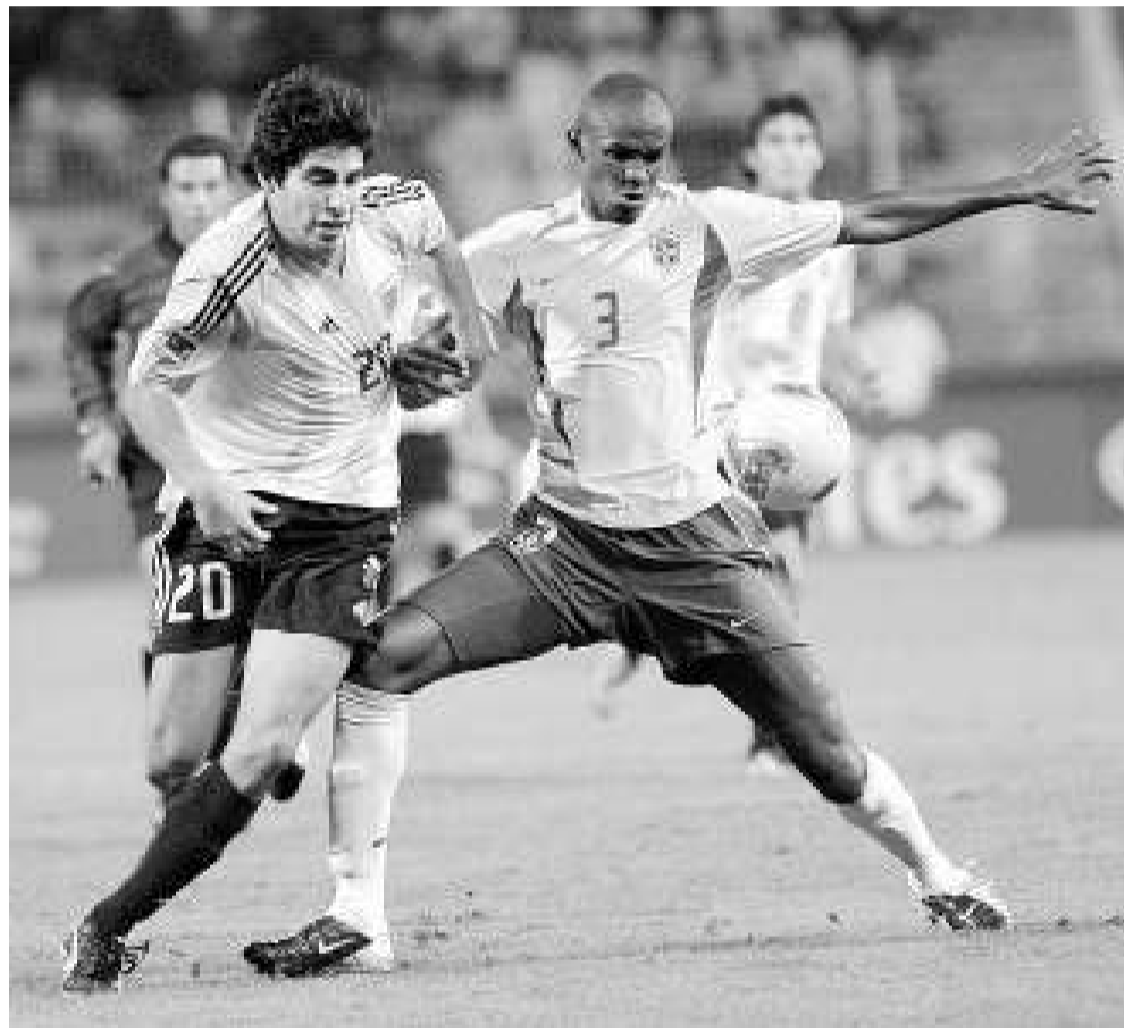
Brazil have only won the championship six times, compared to Argentina's fourteen Copa America victories

Wednesday's semi-final was definitely the poorer without the big stars, though the Uruguayans were hoping for an upset after they led at halftime from a goal by Marcelo Sosa. However, he scored more by luck than judgment — his rather weak header bounced slowly into the net over the Brazilian keeper Julio Cesar, who had dived too early. Uruguay should have been at least two up by halftime, after Dario Silva messed up two chances, his second