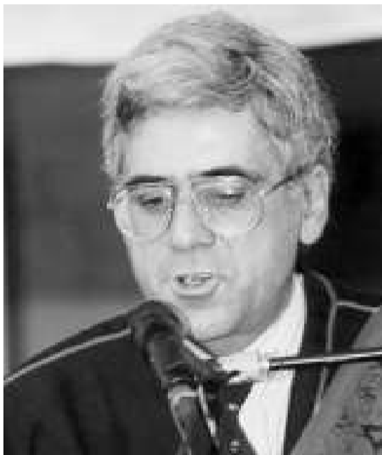
Israeli writer Amos Oz (left), aged 65 and Palestinian philosopher Sari Nusseibeh, aged 55