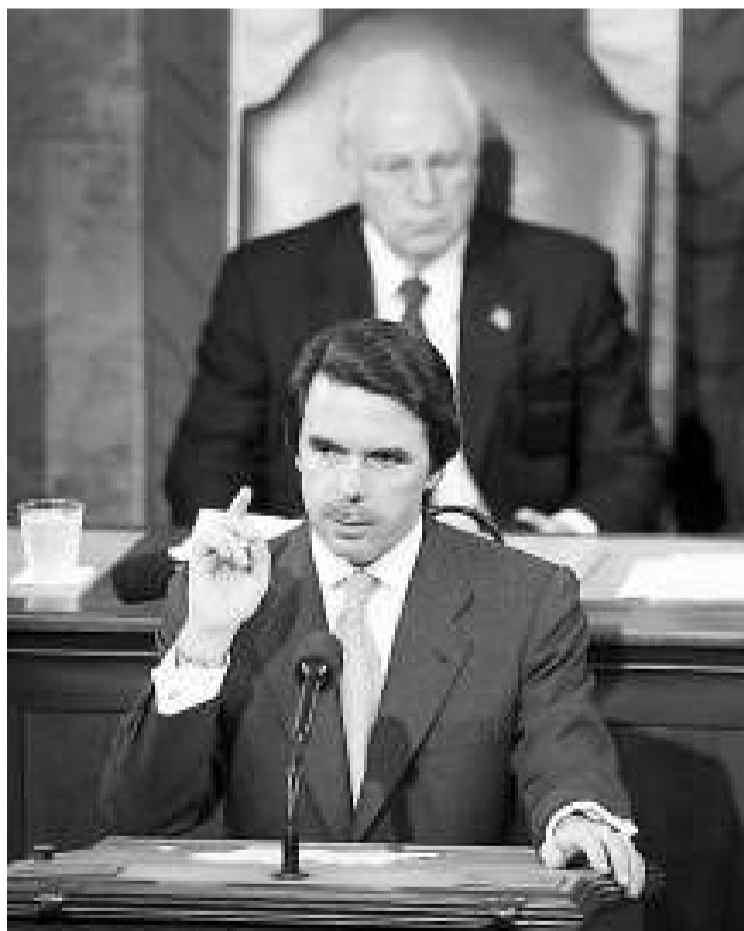
The Partido Popular is being asked to account for millions paid to lobbyist

The Tarragona petrochemical complex wants to recycle water from treatment plants that is currently dumped in to the sea for use in chemical processes. Industries in the area consume about 30 million cubic metres of water a year.