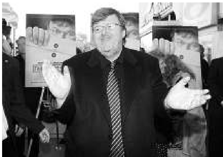
Michael Moore arriving at the June premiere of his film in Washington