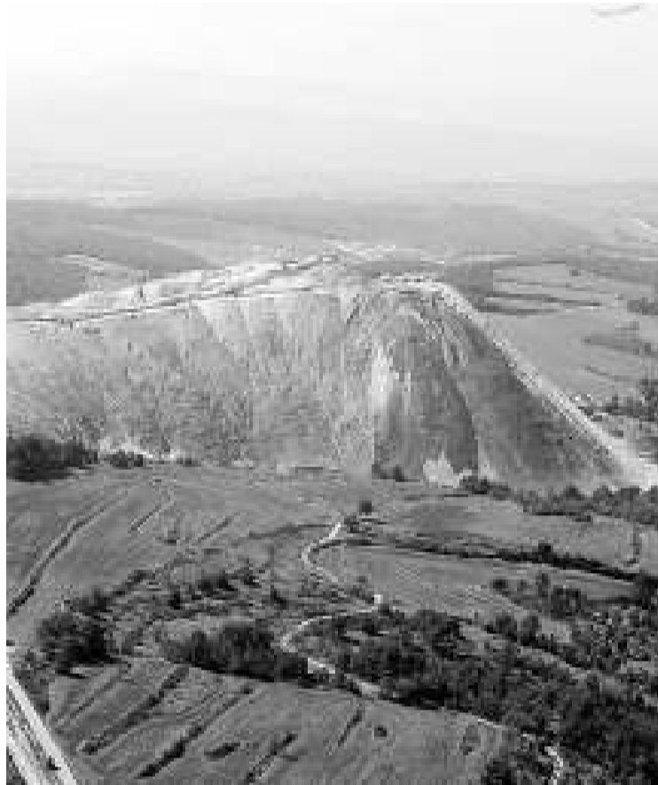
The Iberpotash mine at Bages produces huge amounts of waste salts

Elsewhere, a number of badly-sealed galleries in the mine has caused subsidence in the Estació