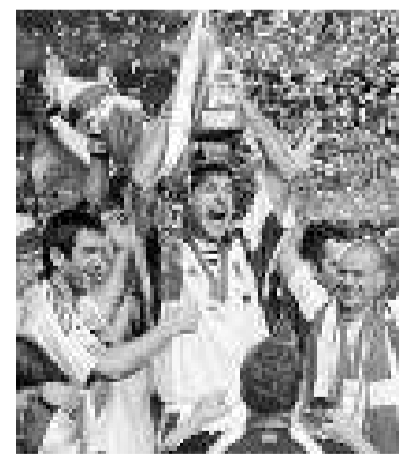
Footballers at a Euro 2004 match

Sporting goods shops also saw sales go up, especially on products such as football shirts, despite a general decline in sales at clothing stores in June. Figures for the month