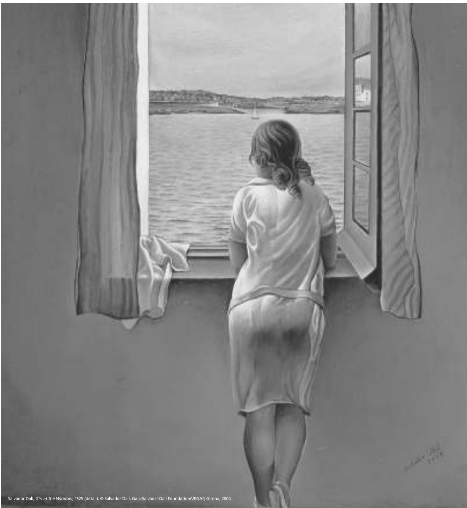
Salvador Dalí, Girl at the Window, 1925 (detail)

The first worm written to infect mobile phones has been detected, according to a security firm in Helsinki, Finland. The worm, which has been called Cabir, infects phones using Bluetooth technology made by Symbian running on Nokia's Series 60 smartphone platform. The worm does not damage equipment but experts are worried that subsequent mobile phone worms with harmful effects may be next. The Cabir worm arrives in phone message inboxes with the file name "caribe.sos" and then places "Caribe" on the phone's screen. The worm becomes active whenever the phone is switched on. F-Secure has put a security patch on its website to detect delete the worm.