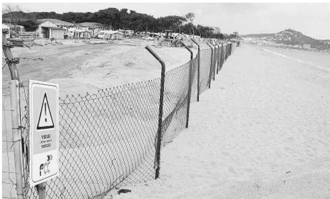
Desalination plants are seen as one way of saving scarce water resources, other measures are planned

The Catalan government will introduce new measures to protect water including better financing of Catalonia's Water Agency and penalising users for excess waste of domestic water in their gardens and swimming pools but it will mean higher bills. The measures will be in line with a national plan for water proposed by the Spanish government which is backing the construction of desalination plants along the coast. The Catalan minister of environment and housing Salvador Milà is seeking cross party support for the measures.