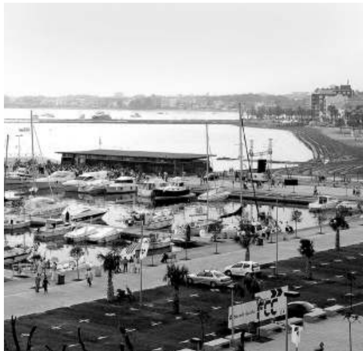
Roses marina, which was opened last Wednesday, will provide 480 new moorings