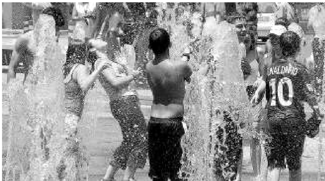
The government is anxious to avoid panic after last year's heatwave left tens of thousands dead across Europe

A forty-eight-year old man died yesterday in Ciudad Real, the first victim of the heatwave that has seen temperatures climb to 45 degrees in southern Spain. Elena Salgado, the Spanish health minister, has appealed for calm, adding that "technically speaking one cannot say it is a heatwave". Meteorological experts say they do not believe we will see a repeat of last summer's long hot summer which left tens of thousands of dead across Europe, especially in France. In regard to the method of recording deaths caused by the heat, which last year was considered inaccurate, Salgado said that the basic approach would not change, but that medical services would be better equipped to identify more precisely the cause of death and would be able to inform the authorities if they considered it to be heat-related. (See page 3)