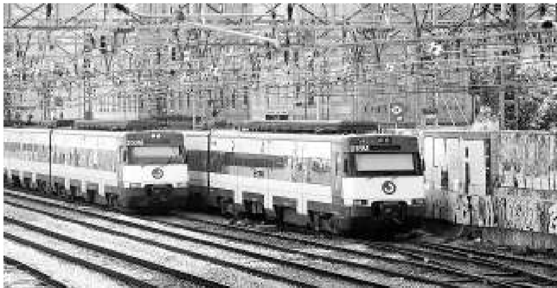
The strike brought the rail network to a complete halt, forcing hundreds of thousands of people on to the roads

Rail workers will continue their series of actions today with a 24-hour strike in protest at plans by Renfe, the national network, to split the company into two. The move is seen by rail workers and their trade union, the CGT, as directly contradicting promises made by the ruling Socialist party to keep the state-owned company intact. The strike is due to end on 5 July. (See page 3)