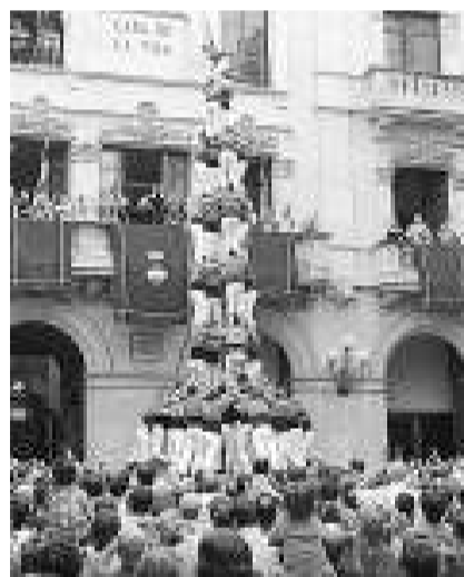
Today is the high point of the annual Havaneres festival in Calafell de Palafrugell while the castellers season also gets under way in Valls and many other towns