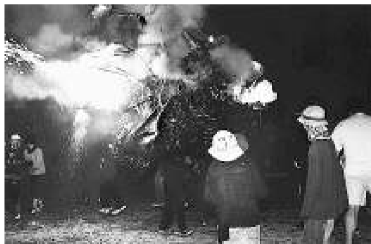
Fire always has pride of place at the Escaldàrium at Caldes de Montbui

The event will last for three days opening on Friday at 6pm and finishing with a firework display on Sunday at 7pm. Further information can be found on the festival website: www.festivalriubaells.net .