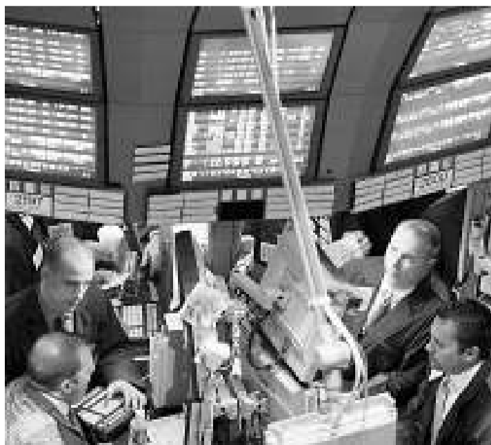
The UK's FTSE was 0.1 percent higher and Frankfurt's DAX was down 0.1 percent

Opening gains on Wall Street helped European shares narrow their declines on Friday afternoon, though doubts over the quality of upcoming company results were underscored by disappointing sales at cosmetics maker L'Oréal. Technology stocks such as mobile phone maker Nokia and German software firm SAP rebounded following a spate of profit warnings this week from U.S. firms such as Veritas and Yahoo. By 2 p.m. yesterday, the FTSE Eurotop 300 index of large European companies was down 0.16 percent at 983.79 points, above an earlier session low of 976.99. The narrower DJ Euro Stoxx 50 index was flat at 2,775.76 points. Recent signs that growth in the world's largest economy may be close to peaking kept investors cautious on equities. "The slowdown has begun,"