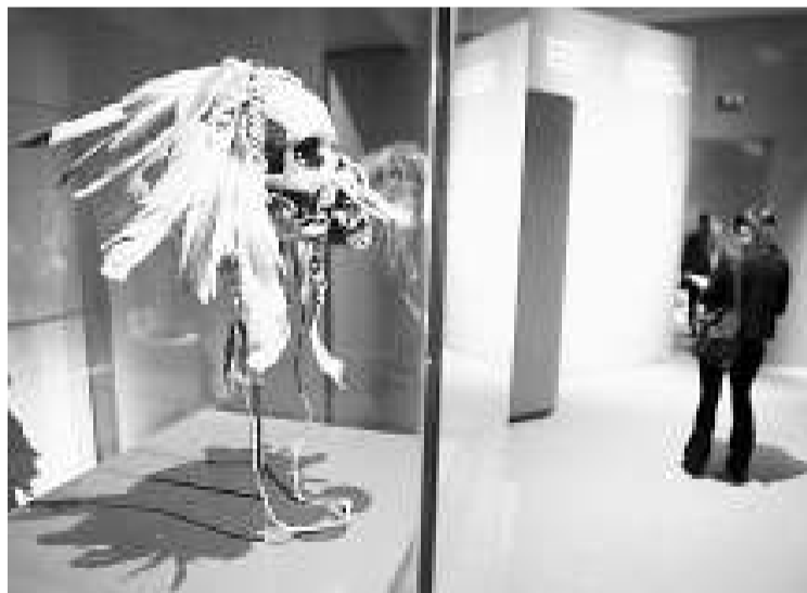
The exhibition opened yesterday at Palau de la Virreina

obvious sexual nuances, mainly due to the big breasts and genitals of the figures. The Commemorative sculpture of a princess , from Cameroon is one of the more important works of the exhibition. The sculpture, also known as the Black Venus and compared to the famous Venus di Milo , belonged to Helena Rubinstein and is shown next to a photograph taken by Man Ray in 1937 with a white female model posing naked in front of it. Another important exhibit from Africa is a fetish with an explicit phallus, which represents a creature that goes out at night to catch thieves, magicians and adulterers. Latin America is a more chaste