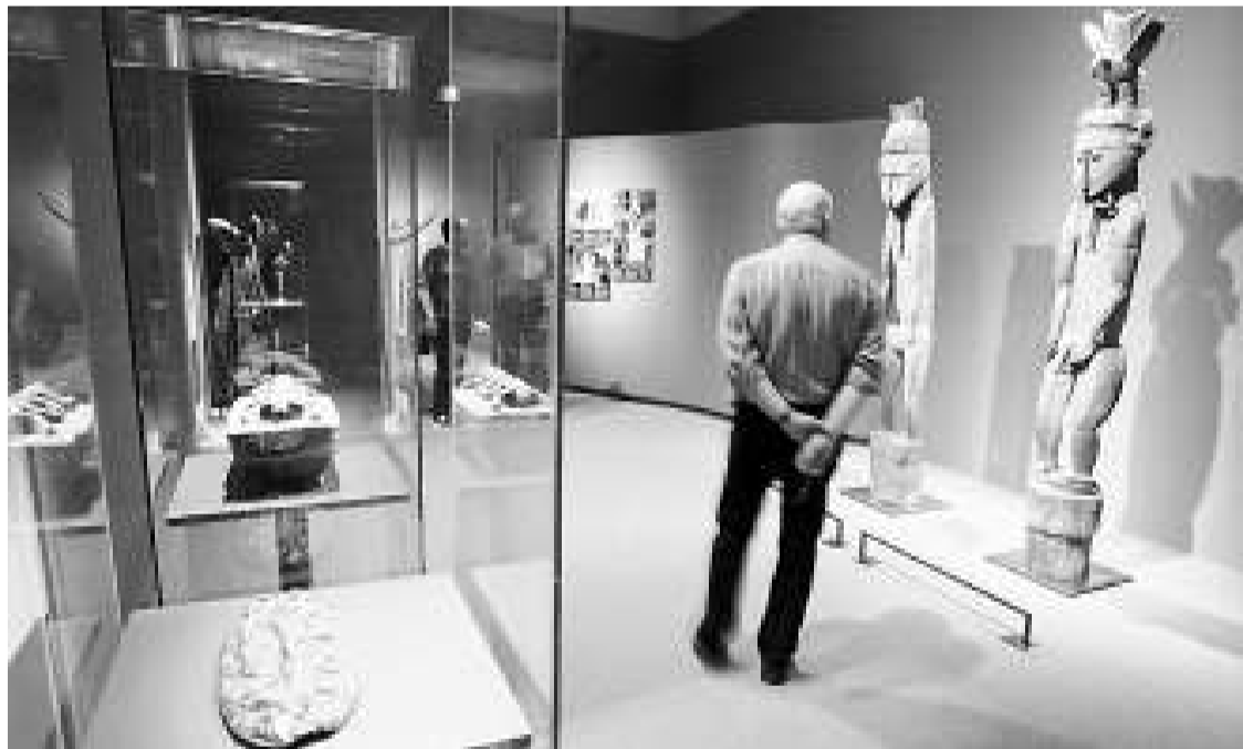
The new exhibition brings together erotic art from numerous indigenous cultures around the world

Statues of women grasping their breasts or posing with their legs open, phallic receptacles and sculptures of hermaphrodites are just some of the exotic exhibits on show at the Palau de la Virreina in Barcelona. The exhibition, which opened yesterday, is comprised of 124 objects from African, American and Oceanic cultures, all of which have distinct erotic or sexual connotations. One of the most outstanding pieces is the statue from Cameroon entitled "Commemorative Sculpture of a Princess", which has also been called the "Black Venus".