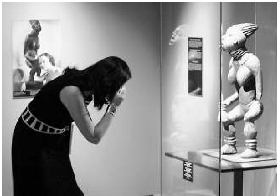
Visitors to the exhibition can see sculptures and art from the four continents / ANDREU PUIG