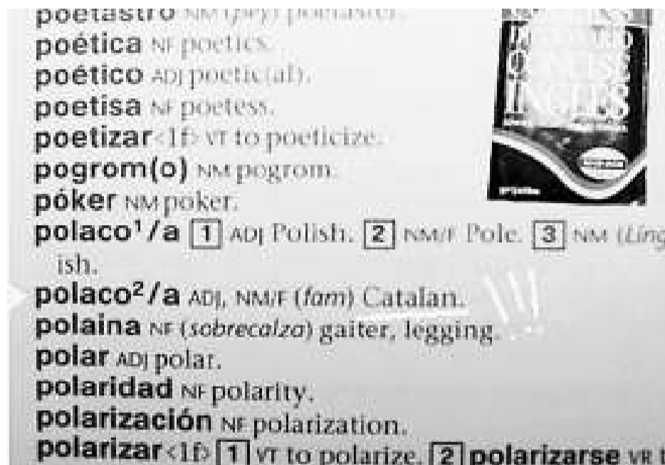
The web page of e-noticias.com who revealed the inclusion of polaco in the new Collins dictionary

Insults of the polaco type are typical of uneasy federations such as the Spanish state or the not very United Kingdom where the English deride their neighbours as jocks, micks or taffies (a corruption of the name Dafyd). However, the Scots, Irish and Welsh don't