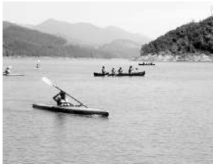
A wide range of sporting and leisure activities are planned for the festival

Not all of them made a fortune, of course, and not all of those who did came home. Yet there was no shortage of those who having made something of themselves on the new continent, usually through the export-import business, decided it was time to return. On getting back to Sitges they started with building their great houses around interior gardens full of plants to remind them of the places that had made them rich. However, they also invested in their hometown, which up until that point had relied on fishing and agriculture. This influx of wealth brought a rail line, electricity and urban development of streets. Their contribution was vital for the later success of Sitges, with some of them even ending up as mayor.