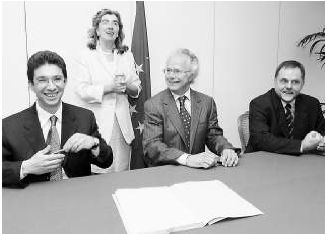
The giant cigarette company will make the payments to the EU over the next three years in return for anti smuggling operations

"We believe that it will enhance the ability of the European Commission and the member states to combat the illegal trade in cigarettes