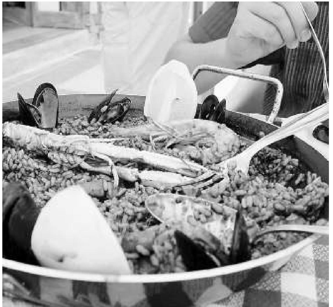
Arròs negre - a Catalan dish made with cuttlefish ink and rice - is as delicious as it is dramatic in its appearance

It was not for a couple of hundred years before savoury rice recipes began to appear, which were usually comprised of rice with offal and stock. By late mediaeval times, rice had become a staple of the Catalan diet and in 1520, the Libre del coch (Cook book) was published, one of the oldest cookery books to