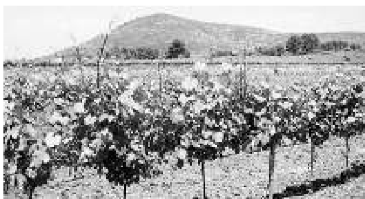
Pesticides containing methyl bromide are harmful to the environment

Tradition and modernity are important features of the project, and the bottle and the logo have been redesigned, while maintaining the brand's distinctive features.