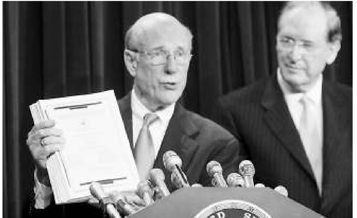
US Senator Pat Roberts, left, presents the report. On his left is Senator Jay Rockefeller