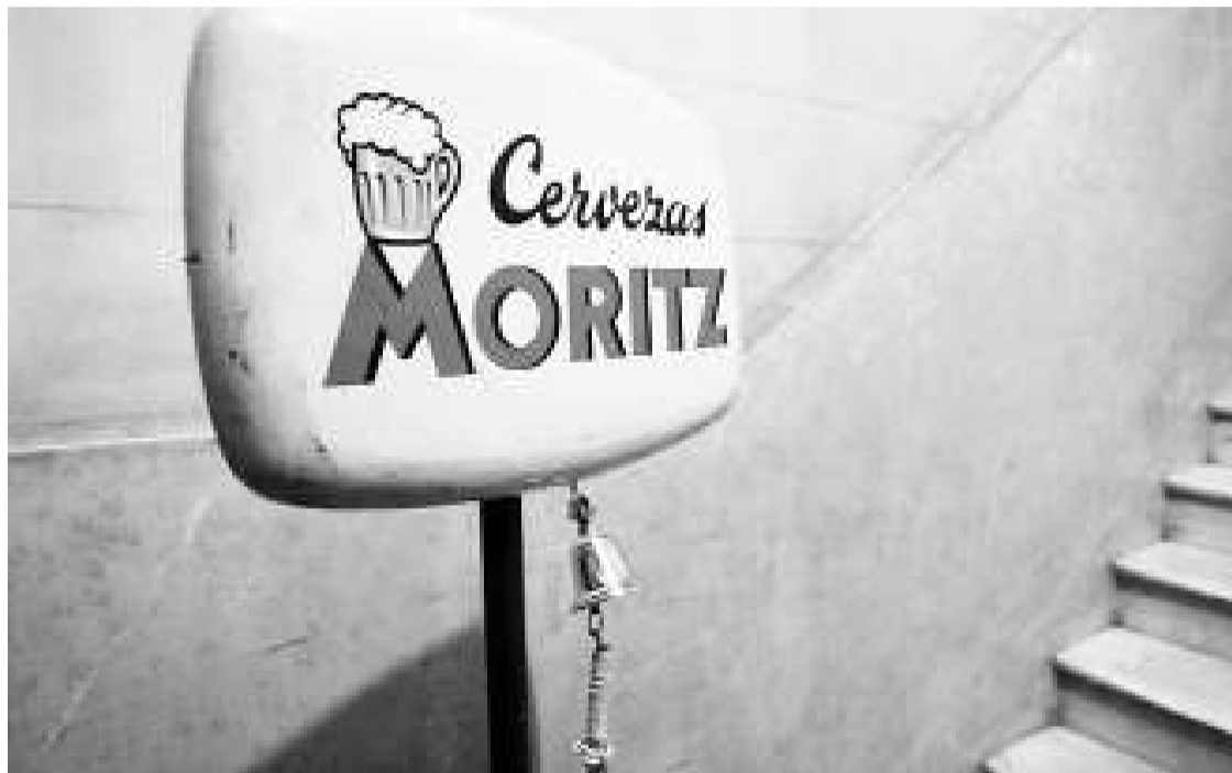
One of the original logos for the beer Cerveses Moritz, which was put on display for the presentation of the relaunch project