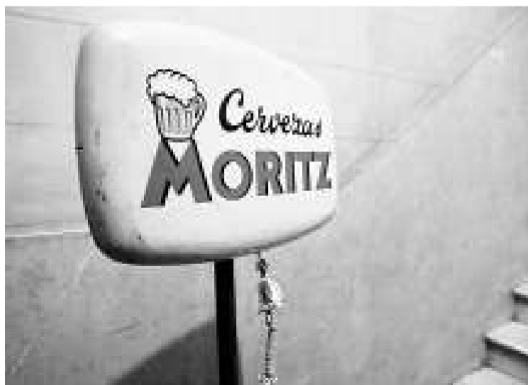
The beer will be relaunched in tandem with an ambitious cultural project

WALL CONDEMNED: According to a leaked document the United Nations court ruled yesterday that Israel's notorious West Bank barrier violates international law and should be pulled down. The court has recognised Israel's duty to protect its citizens but said that it must do so within the law. It also said that Israel should compensate Palestinians for any homes or land that had been lost or damaged as a result of the building of the 100-metre section of walls, ditches and fences. Only American judge Thomas Buergenthal disagreed with the opinion of his 14 international colleagues, the document showed. The Palestinian leader Yasser Arafat hailed the UN ruling as a victory for the Palestinian people.