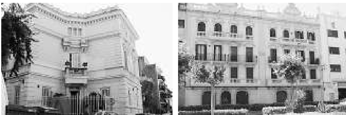
The centre of Sitges and the seafront show many fine examples of Americans' houses. These were people who emigrated to the Americas, made their fortunes and returned to Sitges to spend them, often by building fine houses such as those above