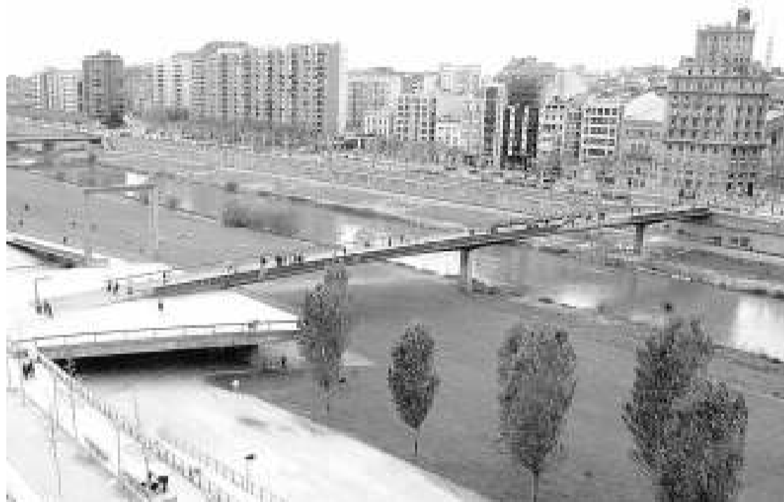
Lleida has undergone considerable growth in the property sector, especially due to demand for second homes