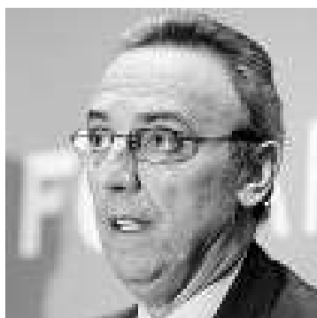
Gaspart spoke at the Forum yesterday

Gaspart, the former president of Barcelona FC, defended the role of businessmen in preserving local culture. "It is clear that business people have to earn money and this is something that we should not be ashamed about," he added. He said