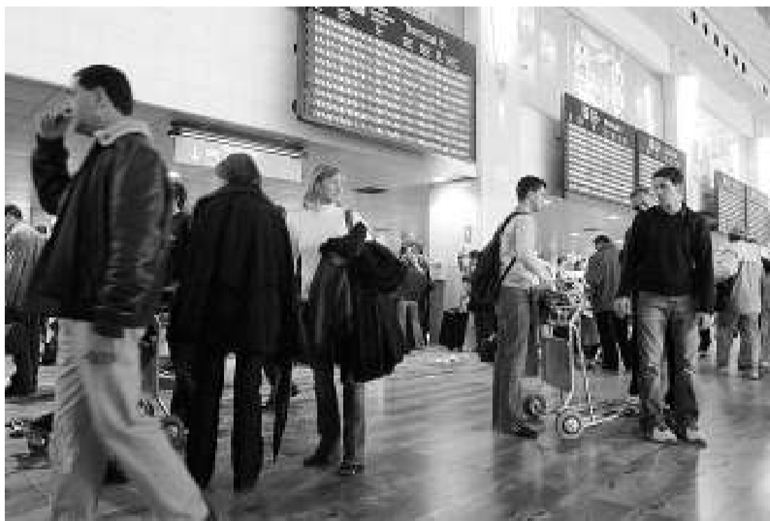
Passenger numbers were up at all Catalan airports, with Girona recording a 156 per cent rise over the first six months of year