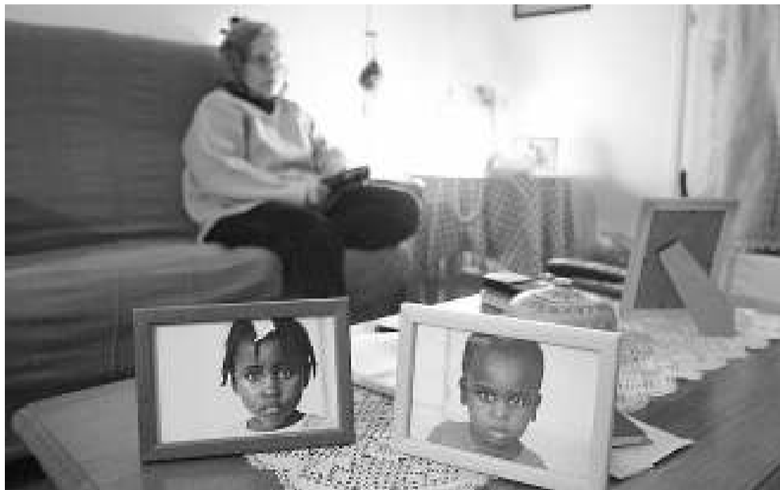
This woman in Arbucies in the province of Girona hopes to adopt two children from Haiti