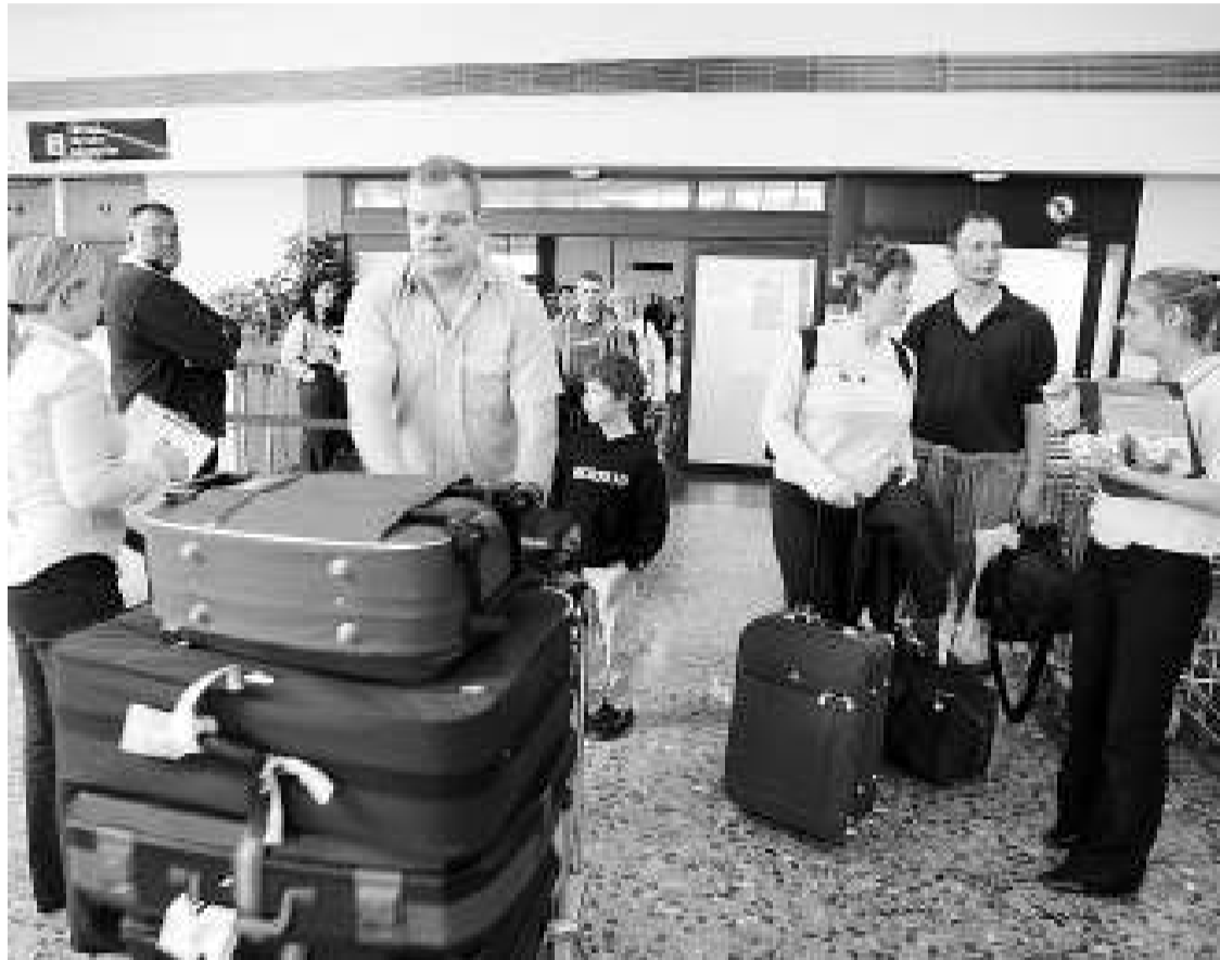
Reus airport has seen an increase in passengers and cargo in past months

Prat has introduced two new routes for direct transcontinental flights this summer, Natal (Brazil) and Havana (Cuba), airport officials reported yesterday. The airline company Varig will make trips to Natal from 25 July to 2 August. Cubana will be flying to and from Havana between 2 August to 25 October.