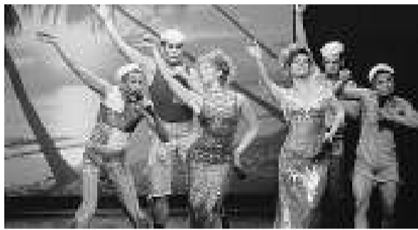
Nia Vardalos and Toni Collette play Connie and Carla