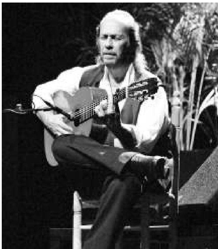
Paco de Lucía is regarded as one of the world's greatest living guitar players. He is currently on a 7-country tour through Europe to promote his latest album

The yearly competition is sponsored by the Prince of Asturias Foundation and gives awards in eight categories each year, including international co-operation, communications and humanities, social sciences, technical and scientific research and sports. Winners of the awards receive 50,000 euros and a sculpture created for the awards by Catalan painter Joan Miró.