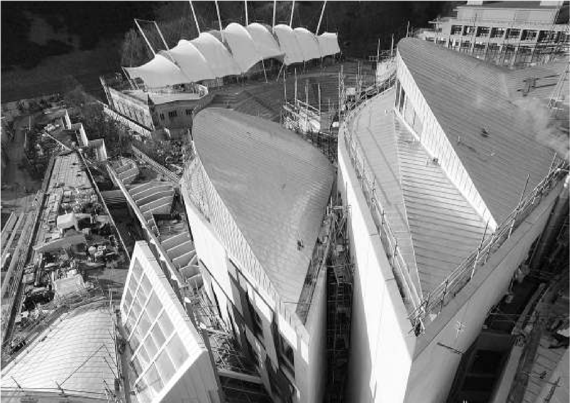
While Catalan architect Enric Miralles' ambitious design for the Scottish Parliament Building has delighted many people in Scotland, the spiralling costs have not / SCOTTISH PARLIAMENTARY CORPORATE BODY