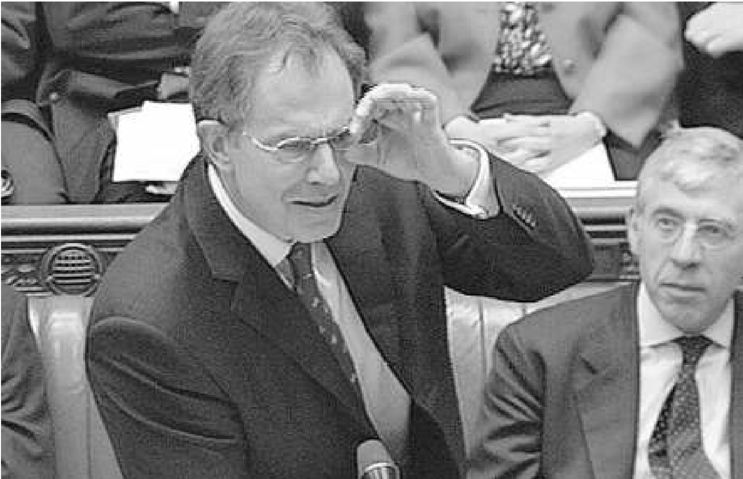
The inquiry into weapons of mass destruction has determined that there was "no deliberate attempt on the part of the government to mislead"