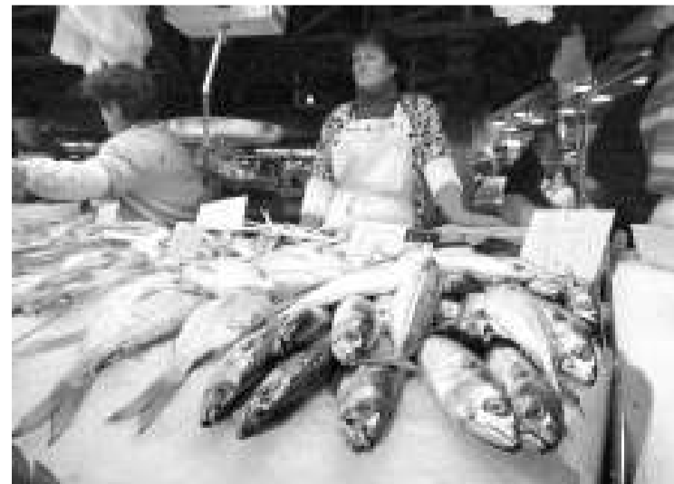
Eating fish and enjoying life helps Spaniards lessen risk of heart disease

He found that hypertension was also responsible for sudden deaths associated with heart conditions and was a risk for sufferers. He dis-