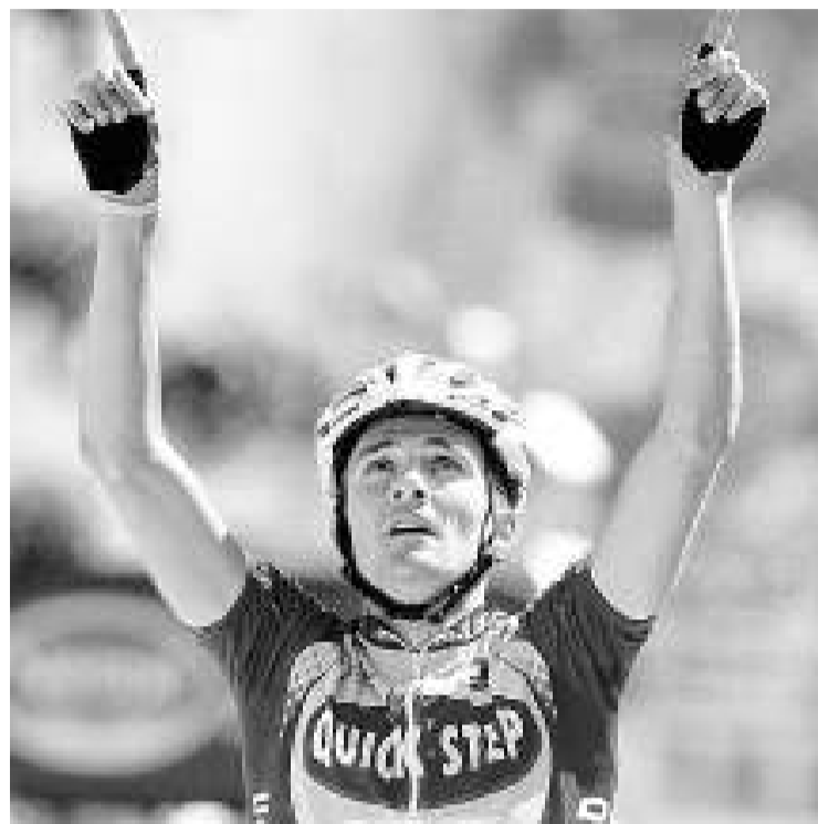
Virenque usually takes at least one stage every year at the Tour

first arrived at Barça, everyone was hoping that he would be a nippy little striker in the style of Michael Owen, who could turn quickly and lose his markers with ease; in the event, he is fast and fairly accurate, but he fails to use his size to his advantage - quite the opposite, in fact, and many's the game in which he has been marked into invisibility. Coach Frank Rijkaard is known to favour bigger strikers who can fight for space in the area, and it remains to be seen whether Ranieri's interest in Saviola joining Valencia will solve Barça's problems.