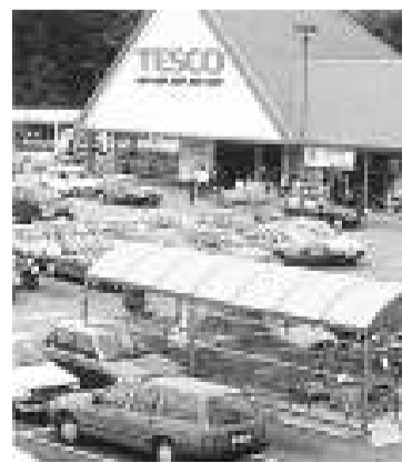
Tesco is branching out into China

Supermarket giant Tesco managed to get a foothold in China with the purchase of a fifty per cent stake in a 25-strong hypermarket chain for 140 million pounds (around 210 million euros), according to the BBC. The foray into the Ting Hsine chain ends a three-year search for a venture partner in the Chinese market. Tesco currently has stakes in twelve countries, including Hungary, Poland, South Korea, Taiwan and Japan. "China is one of the largest economies in the world with tremendous forecast growth," Tesco's Sir Terry Leahy told BBC. Ting Hsine is the largest food supplier in the country and is owner of the Hymall supermarket chain, now half-owned by Tesco. Hymall started out in September 1998 and is one of the