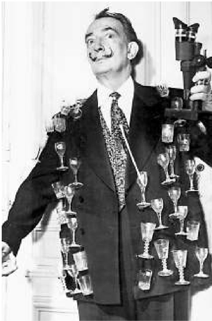
The artist Salvador Dalí during his stay in Paris in May 1964