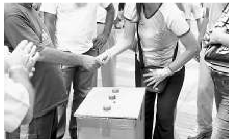
A range of "nuisance" activities are on city hitlist in civic campaign

In the face of growing intolerance of the drummers who gather in Park Ciutadella, Clos promises to try to find a new venue for their im-