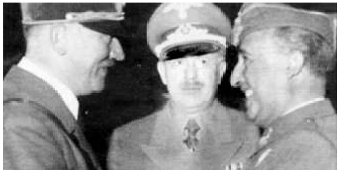
Hitler, pictured here with De Gaulle and Franco, survived virtually unscathed from the failed assassination attempt

rive in Spain by air and the Ministry of Tourism has noted the impact of low cost airlines which now bring in 28 per cent of all visitors, a third more than in the same six-month period last year.