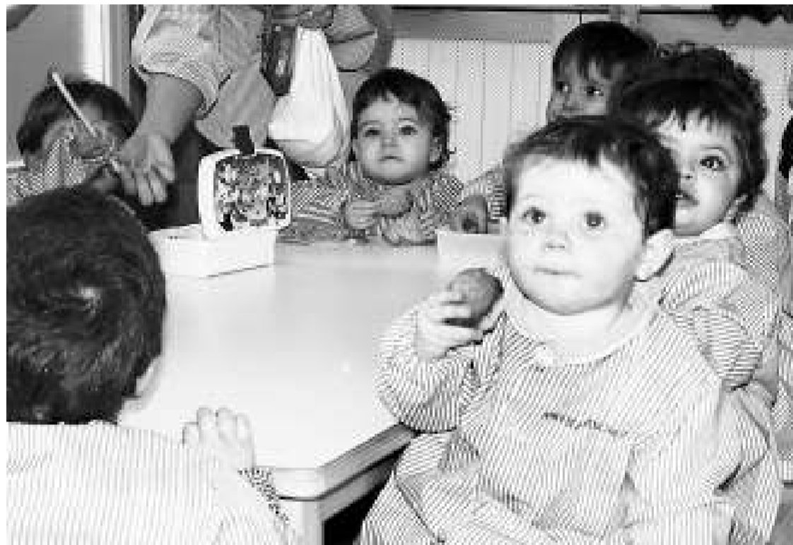
The manifesto complains that not enough of Catalonia's pre-school age children have access to kindergartens / EDUARD VALLES

Catalonia has over 160,000 children of this age, of whom little more than 50,000 have a place at a kindergarten. Fifty percent of these places are at public institutions, while the rest are private. The Parliament recently passed a bill which will force the government to create at least 30,000 new public places for pre-