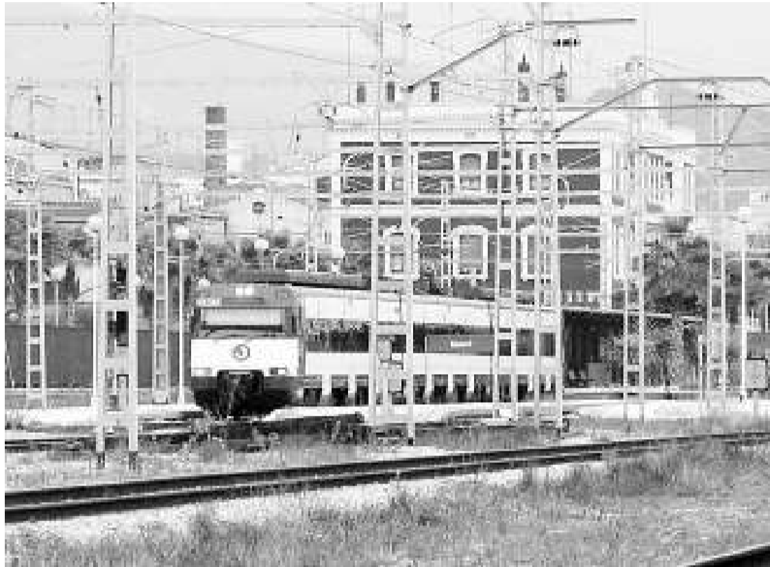
Renfe railway company will be key in setting up the Wi-Fi connection for its infrastructure

Barcelona is already home to a network of wireless access points throughout its districts thanks to the project Sensefils BCN (Wireless Barcelona), which was completed in March. The antennas are installed in