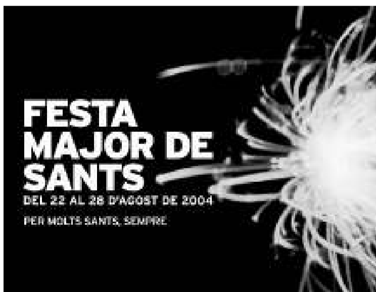
Poster for the festival in Sants in Barcelona.

Police catch beer dealers The police discovered nearly 9,000 cans of beer and refreshments that had been hidden in a Raval phone service provider. It is the largest amount that the police have apprehended. Several officers from the Guardia Urbana were patrolling the Rambla del Raval — where this past weekend a local festival was celebrated — when they came across a number of street beer dealers. Selling at around one euro per can, the dealers tried to conceal their merchandise in plastic bags. Following right behind, the dealers led the police to their hideout, a call centre on carrer Carretes.