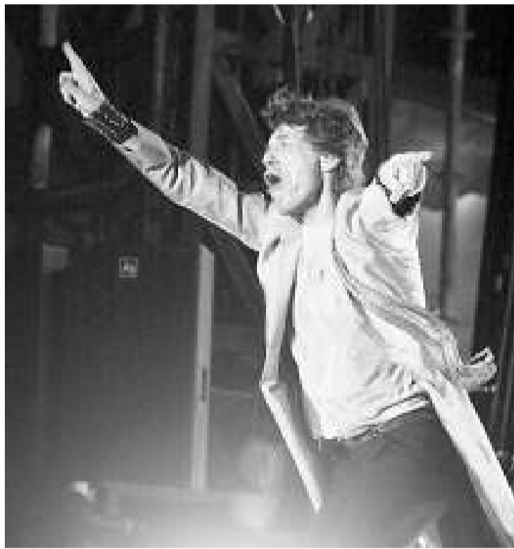
More than 65,000 attended last year's Rolling Stones concert in Barcelona

A total of 3.7 million people attended popular music concerts in 2003, a figure almost identical to that of the previous year. The Rolling Stones concert in Barcelona,