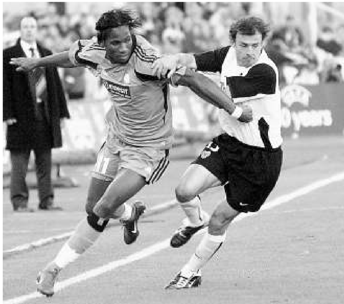
Chelsea's new signing Didier Drogba, who is now probably pocketing more than the GNP for the Ivory Coast, his home country

Because Chelsea is of course a business run by a very able businessman, Roman Abramovich, and it will be interesting to see how the unlikely pairing of Abramovich and Mourinho (Chelsea's new coach) fares next season. Though it goes without saying that he moved to Chelsea partly for financial reasons, José Mourinho also has a little of the purist monk about him when it