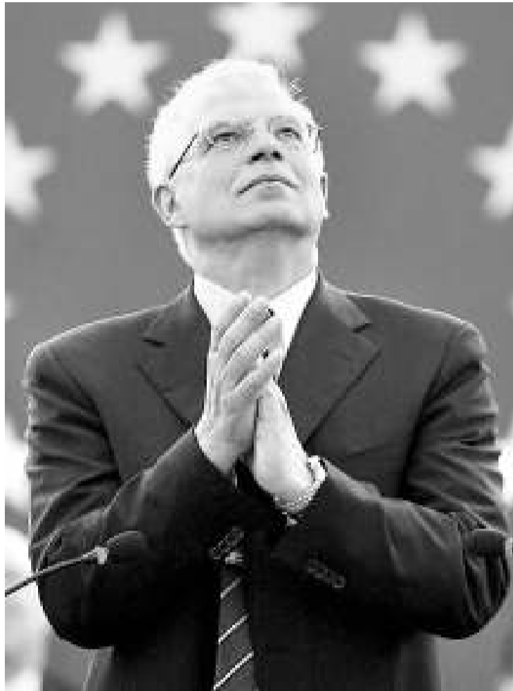
European President Josep Borrell was elected by a clear majority

Born in Lleida, in 1947, Borrell embarked on his political career in Catalonia 1979 and was at one stage leader of the Socialist party. His political