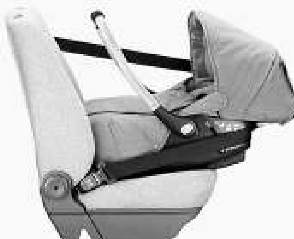
Firms selling children's car seats are currently enjoying a boom

Meanwhile, the Catalan traffic department has said that it will not carry out any specific campaign to catch people not using child's car-seats, though when the Catalan police stop a vehicle for any reason, they will duly fine any drivers not meeting the requirements.