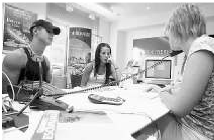
A travel agent assists in the planning of a summer holiday

"This year some travel companies have taken advantage of the entry into the European Union of ten new