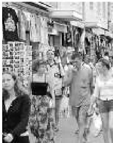
Tourists in Catalonia

The Canaries were the second most popular destination, with Andalusia and the Balearic Islands close behind. Germans were more present than ever in the Balearics while British numbers were down. The reverse was the case in Andalusia where Britons made up 39 per cent of the total. Most visitors ar-