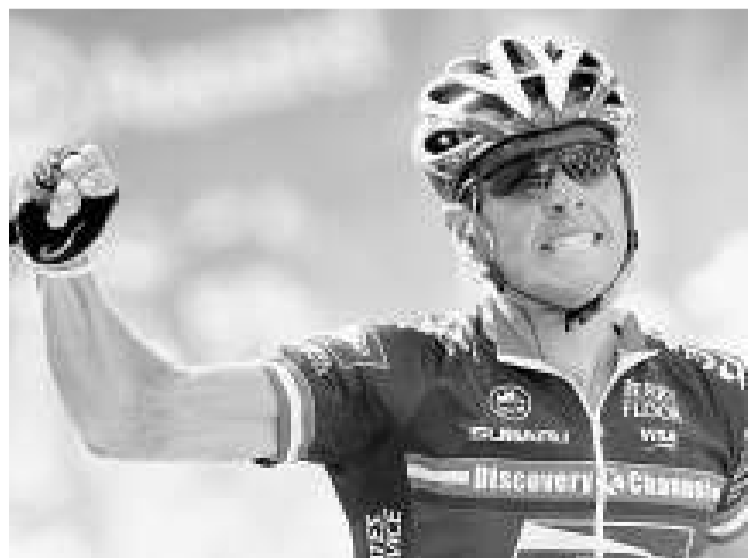
Lance Armstrong takes the overall leader position and the yellow jersey

A man carrying a petrol can was arrested in the grounds of David and Victoria Beckham's Hertfordshire home this weekend, police have confirmed. The intruder was tackled by five guards before police officers and a helicopter arrived at the scene. A 38-year-old man was arrested on suspicion of possessing a controlled drug and carrying equipment to damage the mansion. He was later bailed.