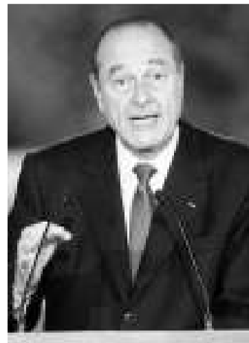
French president Jacques Chirac