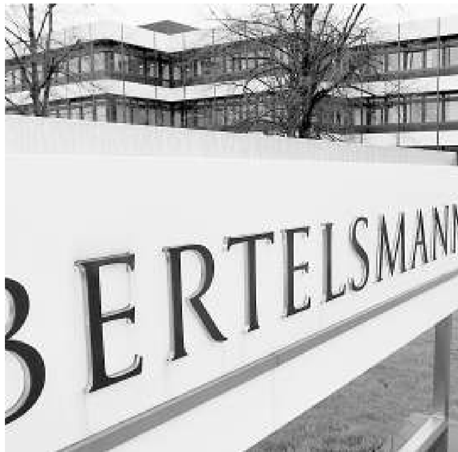
The headquarters of German media giant Bertelsmann in Guetersloh, Germany. Right, the Sony Corporation headquarters in Tokyo

Sony and Bertelsmann have argued that difficulties in the music industry, which is facing declining sales of CDs and illegal download-