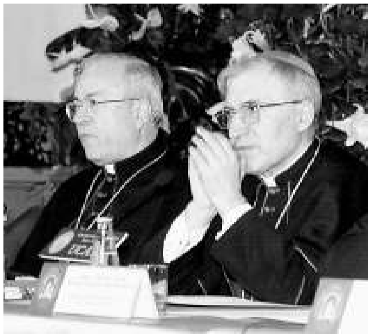
Directors of the Spanish Episcopal Conference