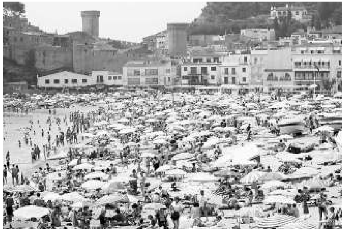
Almost 40 million visitors visited Spain and Catalonia during the first six months of this year, a 4.4 per cent increase overall, with a 9 per cent rise in Catalonia. Pedro Mejía, the Tourism Minister, said that 62 per cent, or 23 million, were tourists, that is, people who stayed more than one night. The most popular destination was the Balears, with 3.8 million tourists, or 16 per cent of the total. The number of German visitors to the islands rose, while the number of British visitors fell. Catalonia is one of the areas that has seen the biggest increase, with over 5 million tourists, while Adalucía has maintained last year's levels. The Canary Isles received nearly 5 million visitors, 21 per cent of the total.

The Filipino lorry driver taken hostage in Iraq was freed yesterday after Manila pulled out the remainder of its troops. At the same time Hazim Tawfiq al-Anachi, the governor of the southern city of Basra, was assassinated at a checkpoint.