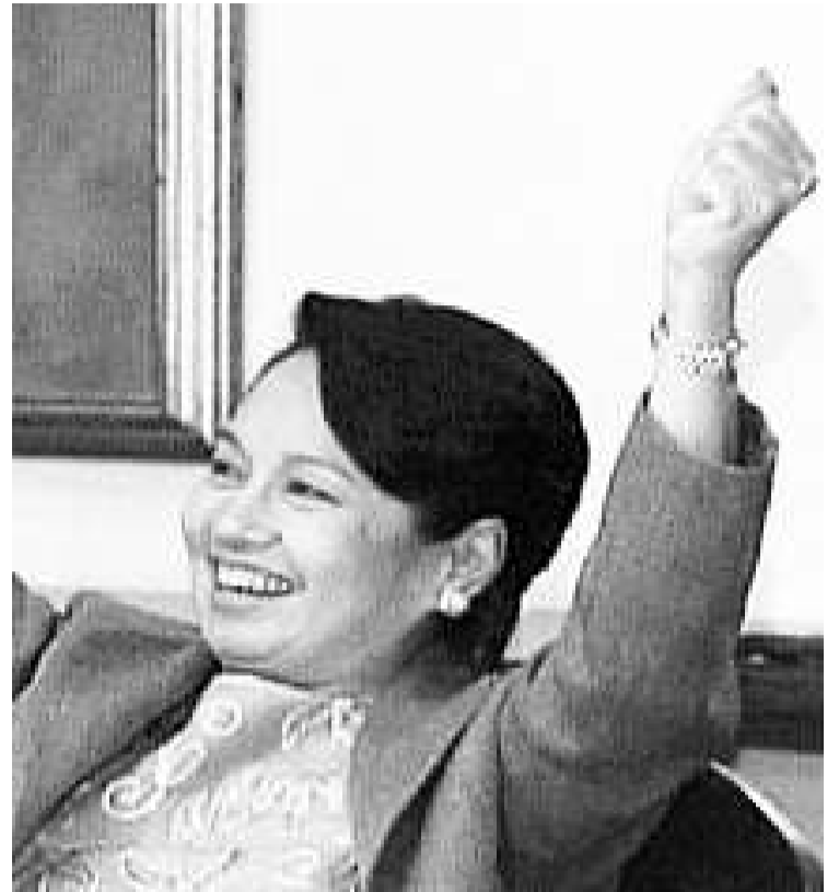
Philippine President Arroyo after hearing the news of the release of the prisoner