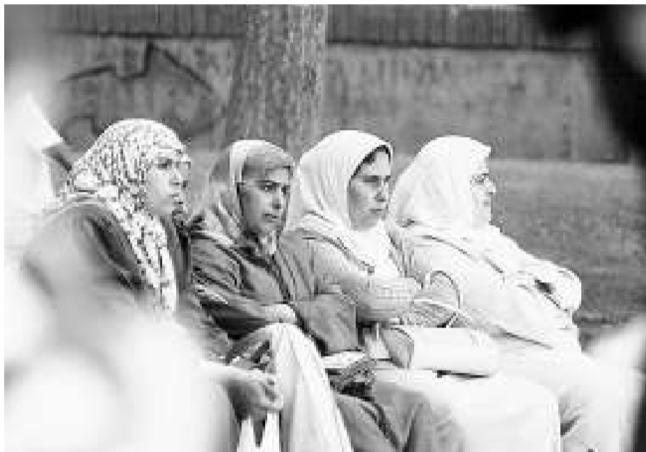
It is easy to pin all our anxieties about the changing world on to the strangers in our midst.

Another recent news story that did not bear thinking about was the detainee at Heathrow airport's immigrant detention centre who was found hanged in his cell. We can only guess at the desperate reasons why a man denied entry into Europe would take his life rather than return home, though we would prefer not to. This story in particular and immigration in general disturbs many of us, as we cannot see where it will all end. But the fact is immigration from developing countries into Europe is not going to go away, and people will have to get used to living with other races, difficult though it may be for some. An elderly neighbour of mine has virtually stopped going out since our neighbourhood turned multicultural. "It's madness," she says, "there's too many of them." Hers is a common form of racism; fear of what she senses as a threat. Interestingly, psychologists say that racism derives from an instinct which, aeons ago, was very useful to human. Picture a small primitive tribe sitting around a camp