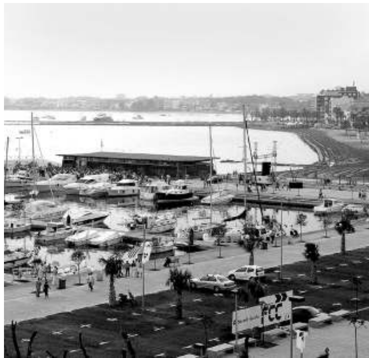
Roses marina, which was opened last Wednesday, will provide 480 new moorings