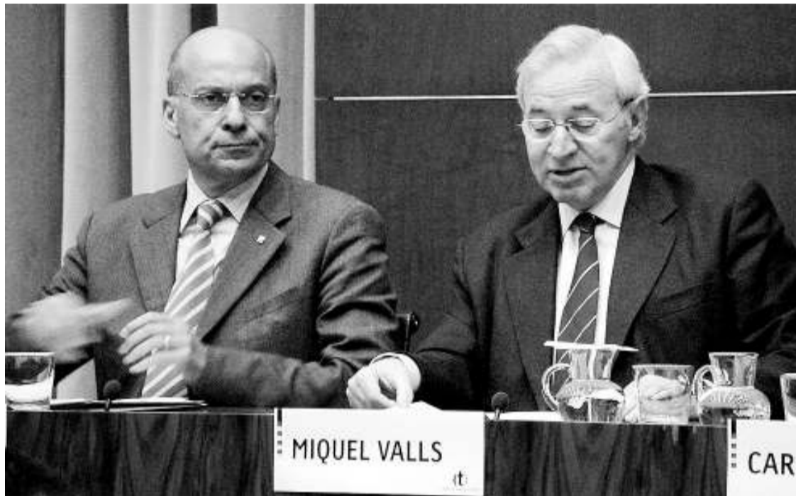
The president of the Barcelona Chamber of Commerce Miquel Valls (right) and Catalan minister of trade Pere Esteve.

The study has established that the B-40 highway will serve three different purposes: it will exist as the city's fourth ring road, bypassing the metropolitan area and connecting