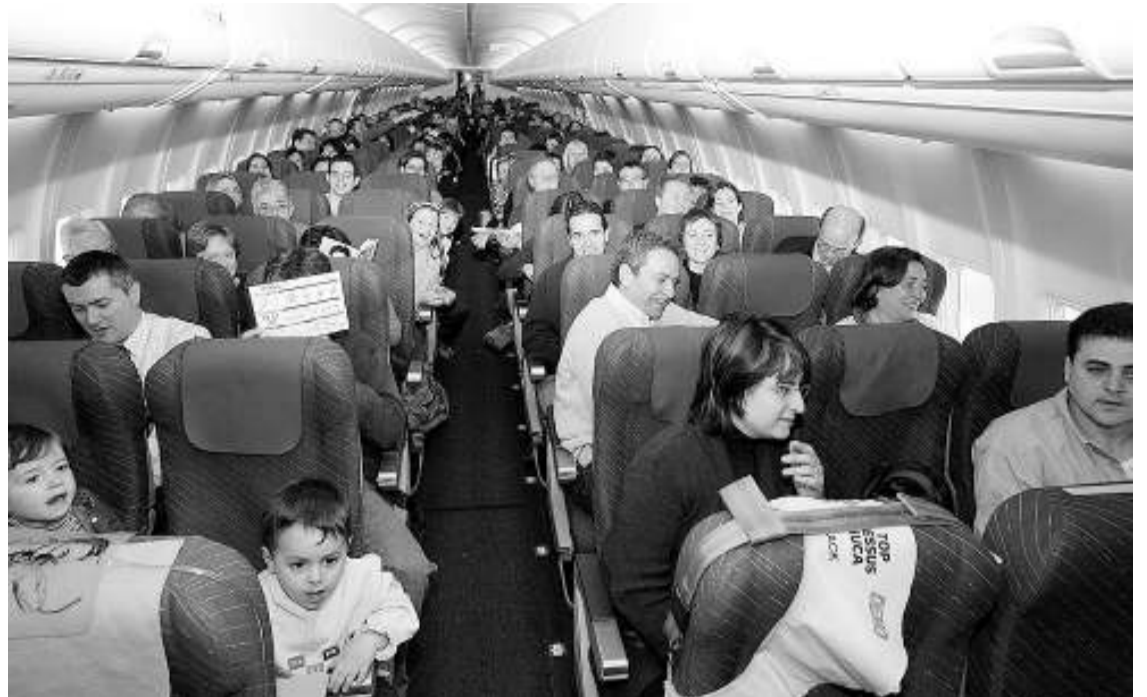
Passenger numbers have risen since the days of the SARS outbreak and the attack on New York's twin towers

Kenneth Lay, the former Chief Executive of Enron, has spoken publicly for the first time about the company's 2001 scandal. According to Lay, the company's finance officer Andrew Fastow was responsible for hiding debts in what turned out to be the largest corporate scandal in history. Fastow has pleaded guilty and has been sentenced to 10 years in prison. Prosecutors have lately been trying to determine if Lay knew about some of the schemes that Fastow used to conceal losses. Lay, who has a close relationship with US President George Bush, had previously refused to testify before investigating committees and made limited comments about the scandal.