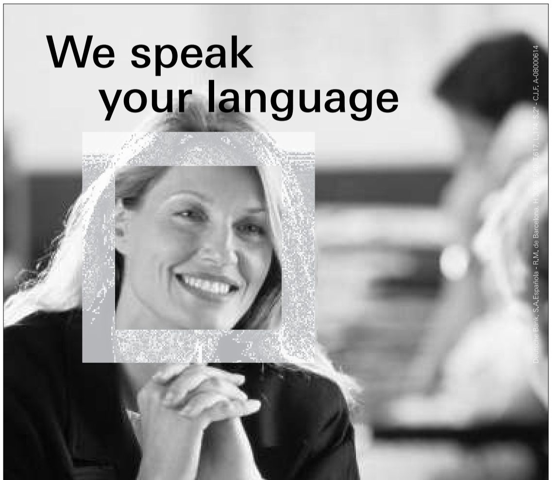
Deutsche Bank S.A. España - R.M. de Barcelona - H. V. 17, L. 174, S. 2º - C.I.F. A-08000614

Deutsche Bank opened its first Spanish branch in Barcelona over 100 years ago. Since then we have worked towards gaining the trust of the national and the international residents.