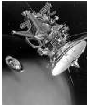
Artist's impression of space probe