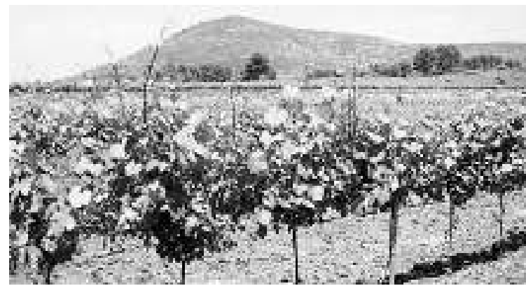
Pesticides containing methyl bromide are harmful to the environment

The Generalitat will set up five lingustic offices that will help preserve and increase the use of Catalan language amongst residents. The offices will be set up in Barcelona, Girona, Tarragona, Lleida and Tortosa, so that residents can make enquires or seek help about linguistic matters, as part of a lingustic plan by the Generalitat.