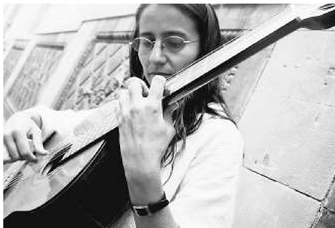
Excellent flamenco guitarists are among the many regular performers to be found around the cathedral

President of the Catalan government Pascual Maragall, speaking in Madrid at the Med2003 conference, claimed that the EU trade agreement the Procès de Barcelona was "really working", and vowed to "breathe new life" into the nine-year-old agreement between the EU and the countries of the Southern Mediterranean. However, he admitted that so far this had only been expressed as a formal request to the EU by Spain's Foreign Minister Moratinos. However, Maragall went on to say that he had a meeting scheduled with President Zapatero on 21 July to discuss the matter.